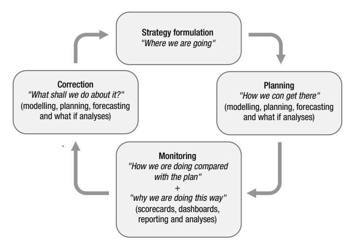
Fig. 1. Four basic steps of CPM (source: designed by the author)

CI has primarily been the domain of medium and large companies that operate on a global scale. Their resources allow them to invest into ICTs and into staff that carry out the CI agenda. Reasons for unexploited CI potential in SMEs are insufficient knowledge of potential benefits from the implementation of CI and the fear of a financially demanding activity that requires a lot of staff commitment and investment in expensive IT tools.