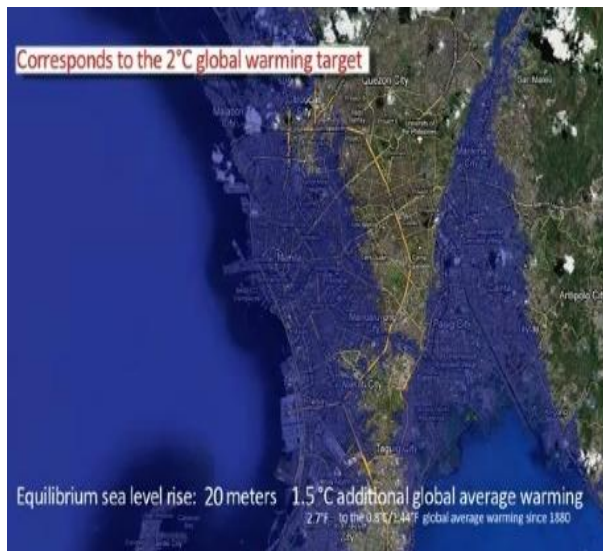
Figure 1. Projected Seawater Rise in Metro Manila