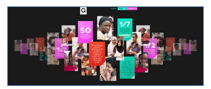
Figure 3 Nike 'The Girl Effect' Campaign, 2014 [34].

international levels through investments in economic, education and health programmes [33]. It is questioned whether the company is merely role-playing as the proverbial 'knight in shining armour', since the campaign has faced pressure for a more holistic and inclusive attitudinal change in men's perspectives. It does provide an example of contemporary brand design practice accepting the challenge to innovate for social change. Retrospectively, the lessons of "anti-sweatshop campaigns" may not have fully alleviated the dented brand or miraculously solved malpractice issues within the complex manufacturing and supply chain systems, yet Nike can prove through this corporate responsibility rebranding strategy that it has gone a substantial way to re-engage loyal consumers instead of "hoping (the problem) will go away" [32].