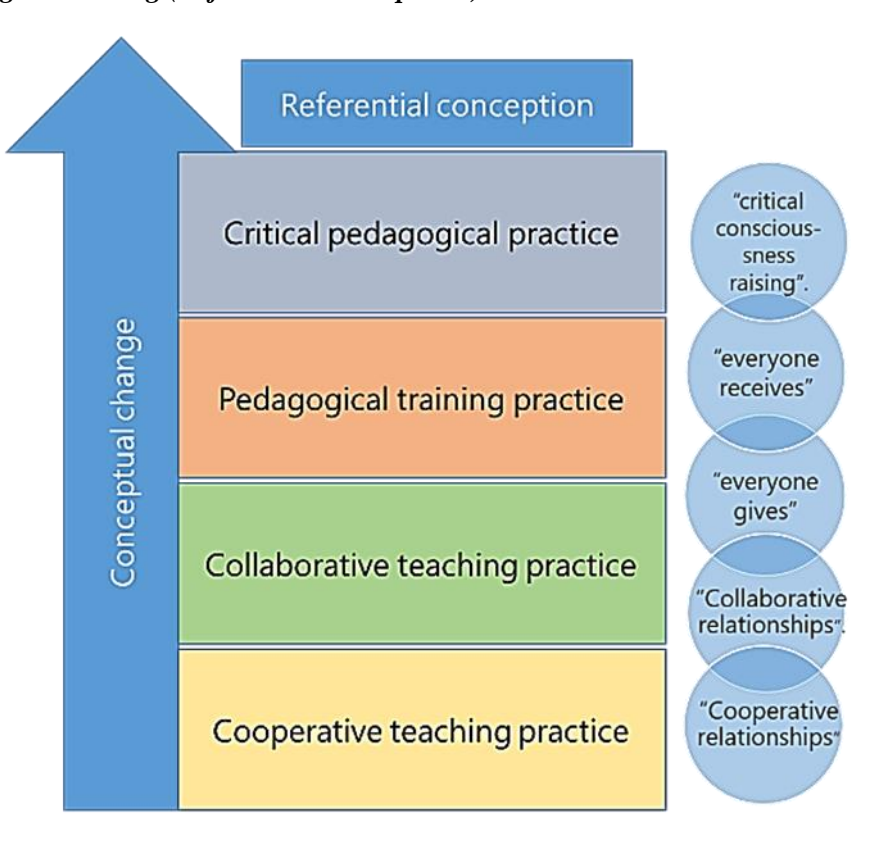
Figure 1 Understanding Coteaching (Referential Conceptions)

The first transition is directly related to the evolution of cooperative relations and establishing a teacher collaboration strategy. Professors move from relationships in which only certain teaching responsibilities are shared into relationships that encourage constant and simultaneous partnership in planning, instruction, and evaluation. Two different categories emerged when separating "cooperative" and "collaborative" conceptions. It is worth distinguishing between these concepts, which even today, some teachers are unaware of their