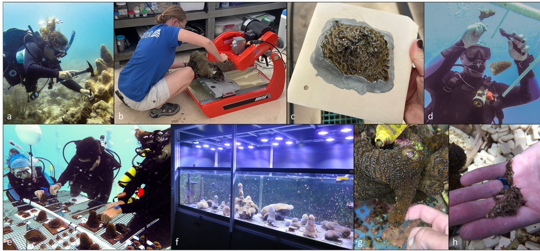
FIGURE 1 | Collection, preparation, and care of Dendrogyra cylindrus rescue fragments. Fragments were collected from the reef using hammer and chisel (a). Excess skeleton was trimmed (b) and fragments were mounted on tiles (c). Early fragments in offshore nurseries were suspended from trees (d), but all offshore holding eventually moved to mounted fragments (e). Onshore fragments were held in a variety of aquarium systems (f). Development of gemmae on rescue fragments appeared as an attached growth of soft tissue (g) with internal skeletal fragments (h).