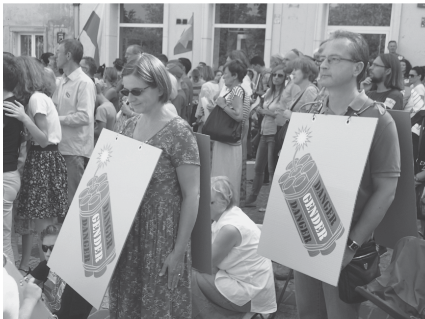
Figure 1.1 Demonstration “Stop Depravation in Education,” Warsaw, Poland, 2015.