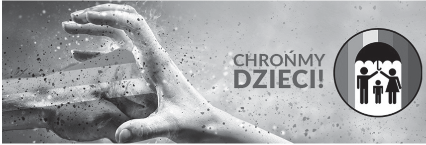
Figure 3.1 Poster from Ordo Iuris campaign “Let’s Protect Our Children,” 2018.

is always there: a heterosexual heteronormative family with children that needs to be sheltered against the threat signified by the rainbow.