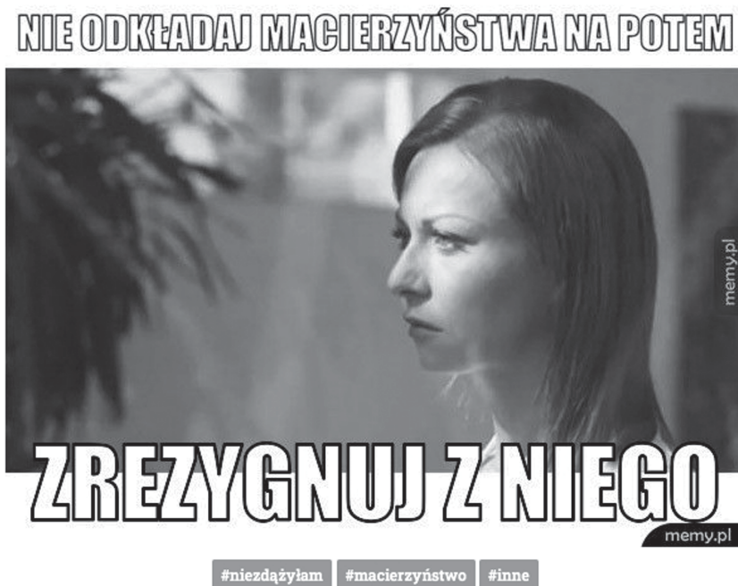
Figure 5.1 Screenshot of the meme responding to the campaign “Don’t Put Motherhood Off.”