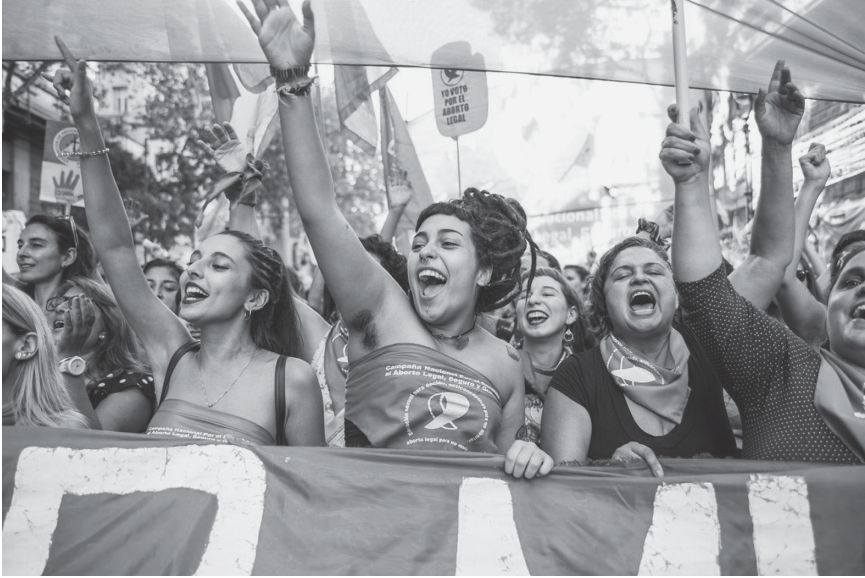
Figure 6.2 Demonstration on 8 March 2018. International Women’s Strike, the National Campaign for the Right to Legal, Safe and Free Abortion “ Campaña Nacional por el Derecho al Aborto Legal, Seguro y Gratuito ” Buenos Aires, Argentina.