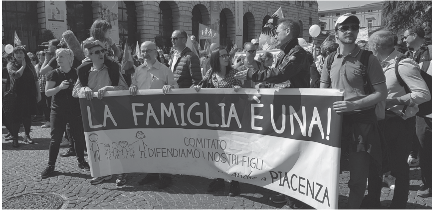
Figure 2.2 March for the Family in Verona, Italy, 2019, organized by the World Congress of Families.

Women's rights – a set of issues that had been dismissed for decades as mere distractions from real political struggle, as “cultural” or “identity” politics – proved to be the biggest mobilizing factors at a time of political crisis. In terms of sheer attendance, feminist protests attracted incomparably more people than “pro-family” marches ever had. For example, the March for the Family organized by the World Congress of Families in Verona in March 2019 (Figure 2.2) was attended by a thousand participants at most, whereas a feminist protest against the WCF (Figure 2.3) gathered at least