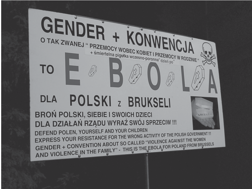
Figure 4.2 Demonstration “Stop Depravation in Education,” Warsaw, Poland, 2015. Banner stating: “Gender + Istanbul Convention is Ebola from Brussels.”

easily controllable and unable to oppose transnational institutions and local agents of the “civilization of death.” Such conspiracy theories are legitimate political currency in today’s Poland, as exemplified by the public statement of Paweł Kukiz, an MP and former presidential candidate who received over 20 percent of the vote in the first phase of the May 2015 election. Commenting on the ongoing refugee crisis, he asserted that EU migration policies are in fact aimed at extermination of the Polish nation: