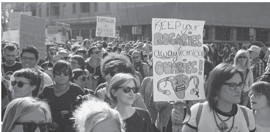
Figure 2.3 Feminist March in Verona, Italy, 2019, held under the banner “Verona Transfeminist Parade.”