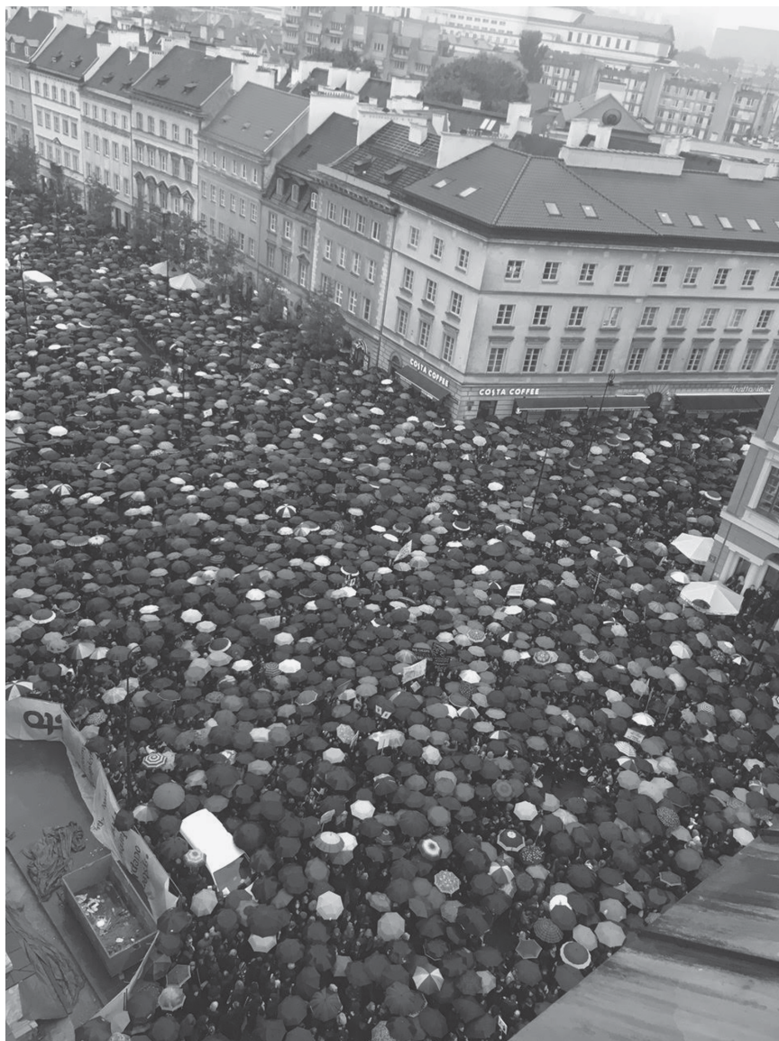
Figure 6.1 Polish Women's Strike at Castle Square in Warsaw, Poland, 2016.