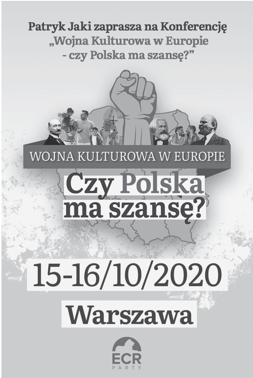
Figure 2.1 Poster for the conference “Culture War in Europe: Does Poland Stand a Chance?” organized by Patryk Jaki, Warsaw, Poland, 2020.