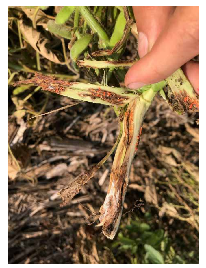
Figure 7. Soybean stem with removed epidermis revealing large soybean gall midge infestation.

Scouting should concentrate in fields that are adjacent to a soybean field from the previous year. Early season scouting should focus on darkened and/or swollen stems at or near the base. Larvae presence can be confirmed by peeling back the epidermis of darkened stems (Figure 7). Later in the season wilting and/or dead plants may be present along field edges. Contact your local extension office to report infestations.