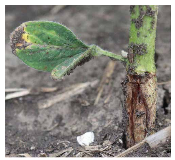
Figure 5. Darkened and swollen soybean stem resulting from soybean gall midge infestation.

Larvae feed beneath the soybean epidermis near the stem base causing necrosis and brittle tissue. Early signs of infestation include darkened/necrotic stem bases (Figure 5) followed by leaf wilting, typically occurring after V2 stage. Swollen outgrowths may be visible near the base of stems. High infestations cause stems to break near the base resulting in plant death at V5 (Figure 6). Plant injury is greatest at field edges.