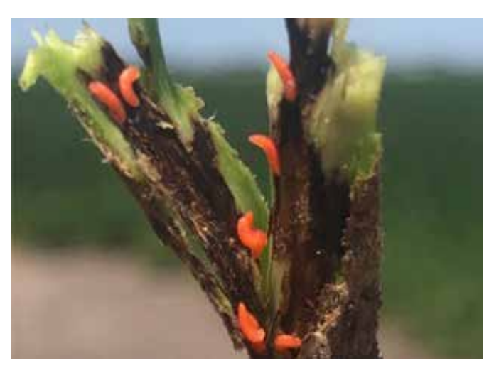
Figure 3. Late instar larvae.