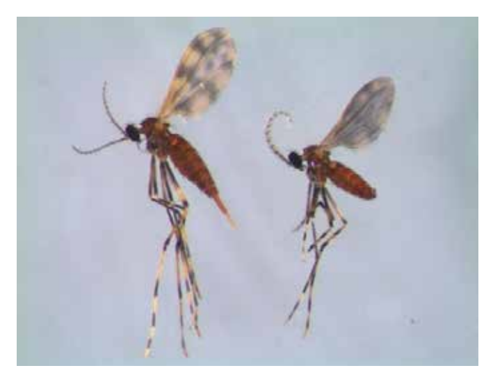
Figure 4. Adult female and male soybean gall midge.