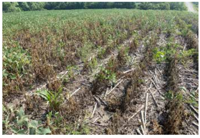
Figure 6. Soybean field with severe soybean gall midge infestation resulting in economic injury and plant death.