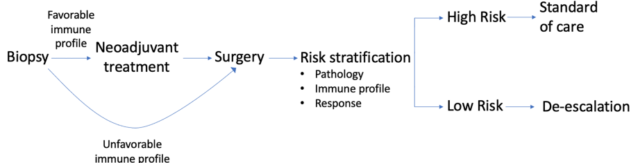
FIGURE 3 | Immune profile of biopsied tumor can indicate need for preoperative immunotherapy in OCSCC. After definitive surgery, risk stratification can be done using pathologic data, immune profile, and response to initial treatment. Level of risk can then dictate adjuvant therapy.

tumor-specific algorithms to achieve better oncologic and functional outcomes we will one day be able to change the treatment of OCSCC for the better.