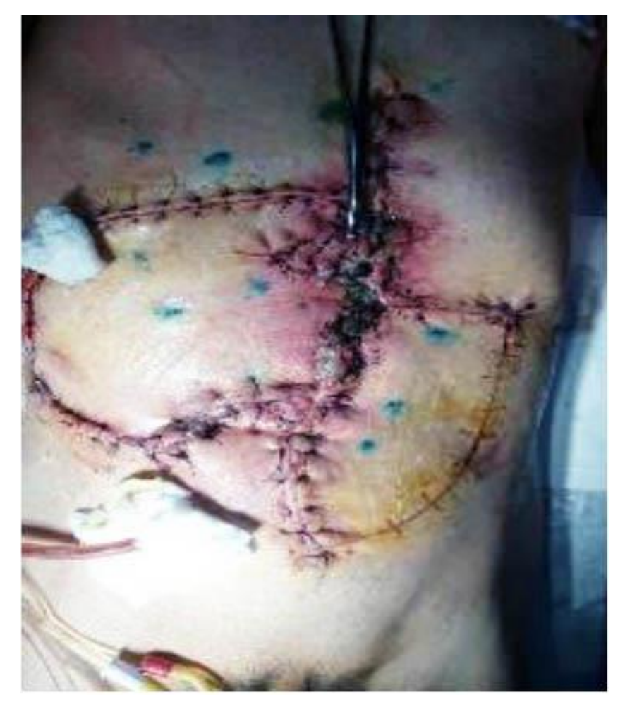
Fig. 2. External view of the anterior abdominal wall after closing the defect with a plastic Keystone flap from the right half of the abdominal wall

the right half of the abdominal wall. At this stage, the wound area was closed on 100% (Fig. 2).