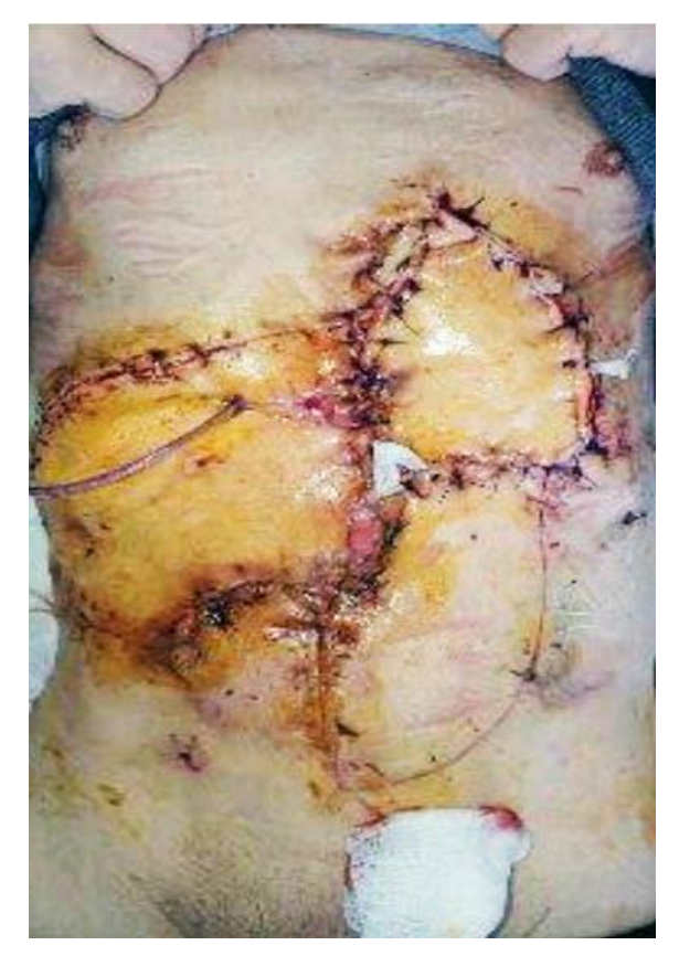
Fig. 3. External view of the anterior abdominal wall after defect re-plasticity using a Keystone flap formed by a fragment of soft tissues of the