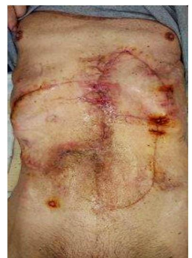
Fig. 4. Patient K. Postoperative period. The primary tension of the wound

In the postoperative period, the wound healed with primary tension, the patient was discharged with sutures for further outpatient treatment in the clinic at the place of residence (Fig. 4).