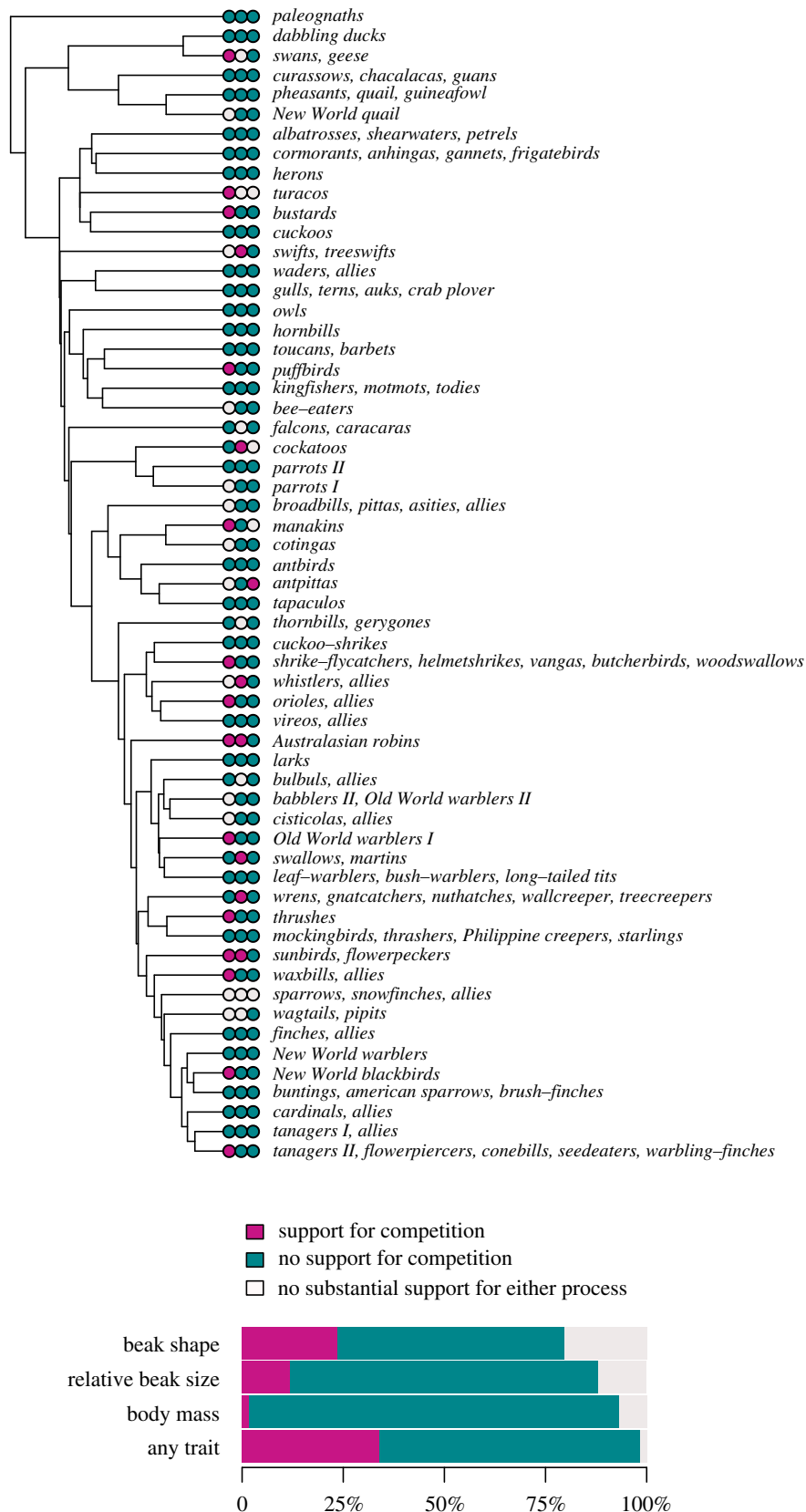
Figure 2. The signature of competition across 59 avian orders and super-families. Support for competition (purple) is determined by whether a diversity- or trait-dependent model best explains the data in the focal clade, with an AICc difference greater than two compared with any model assuming lineages evolve independently. The following ecomorphological traits are considered (left to right circles): beak shape (purple indicates the signal of competition in either PC1, PC2, PC3 or PC4), relative beak size and body mass. Twenty out of 59 clades show support for competition in either beak shape, size or body mass ('any trait' in the stacked bars). Clades where models with and without competition cannot be distinguished by an AICc difference greater than two are marked by light grey. (Online version in colour).

and 6 for the MC) in either beak shape, size or body mass (electronic supplementary material, figure S4). The electronic supplementary material, appendix S4 provides estimated model parameters and model fit for each clade.