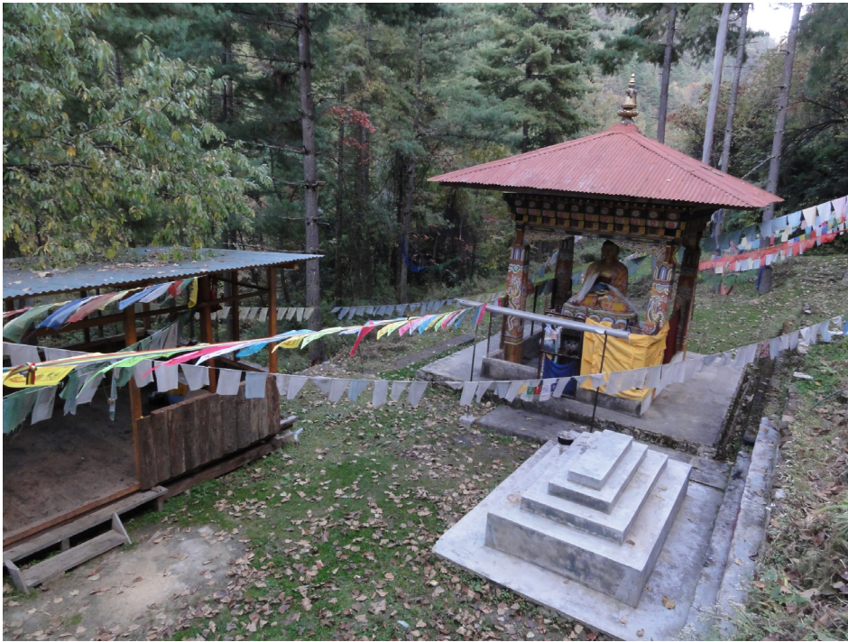
Figure 1. The Buddha statue built at the site of a former slaughtering ground.