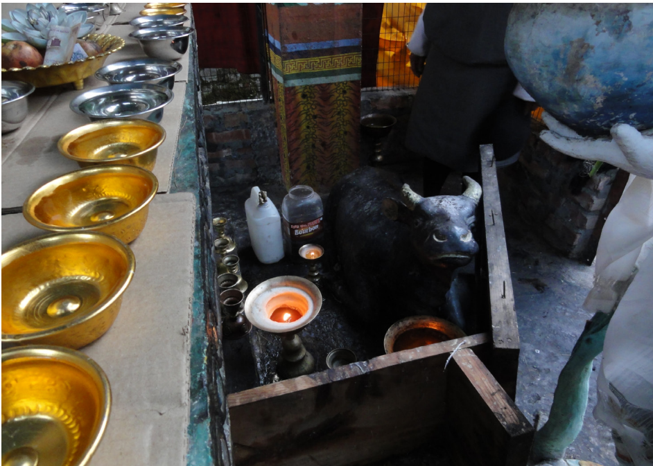
Figure 3: Statue of a cow placed at the feet of the Buddha statue installed at the site of a former slaughtering ground.

The practice of tsethar challenges livestock breeding and the consumption of meat, which has traditionally been central to Bhutanese food habits. This is also true for Buddhist monks and nuns, as they are free to eat meat from an animal killed by someone else. Why was the longstanding practice of animal slaughter for consumption thus suddenly challenged? Is there a context beyond the act of compassion to view