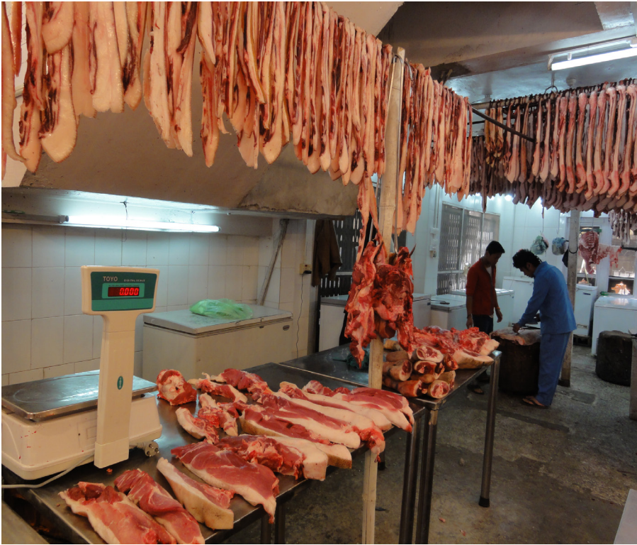
Figure 4: A meat shop in Thimphu.

a radical change in subsistence for them, since cash is often scarce in an agricultural economy more accustomed to barter and reciprocal exchange of goods.