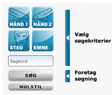
Figure 1: Traditional search functionality as seen in the online Danish Sign Language dictionary (Center for Tegnsprog, 2008).

The paper is structured as follows: in Section 2 we give an overview of methods that utilize Dynamic Time Warping in the gestural and sign language domain. In Section 3 we describe our methodology regarding the extraction of the body joint coordinates as well as the experimental setup, analysis, and visualization tool. In Section 4 we present the results of our experiments. We discuss them in Section 5 and conclude and motivate future research in Section 6.