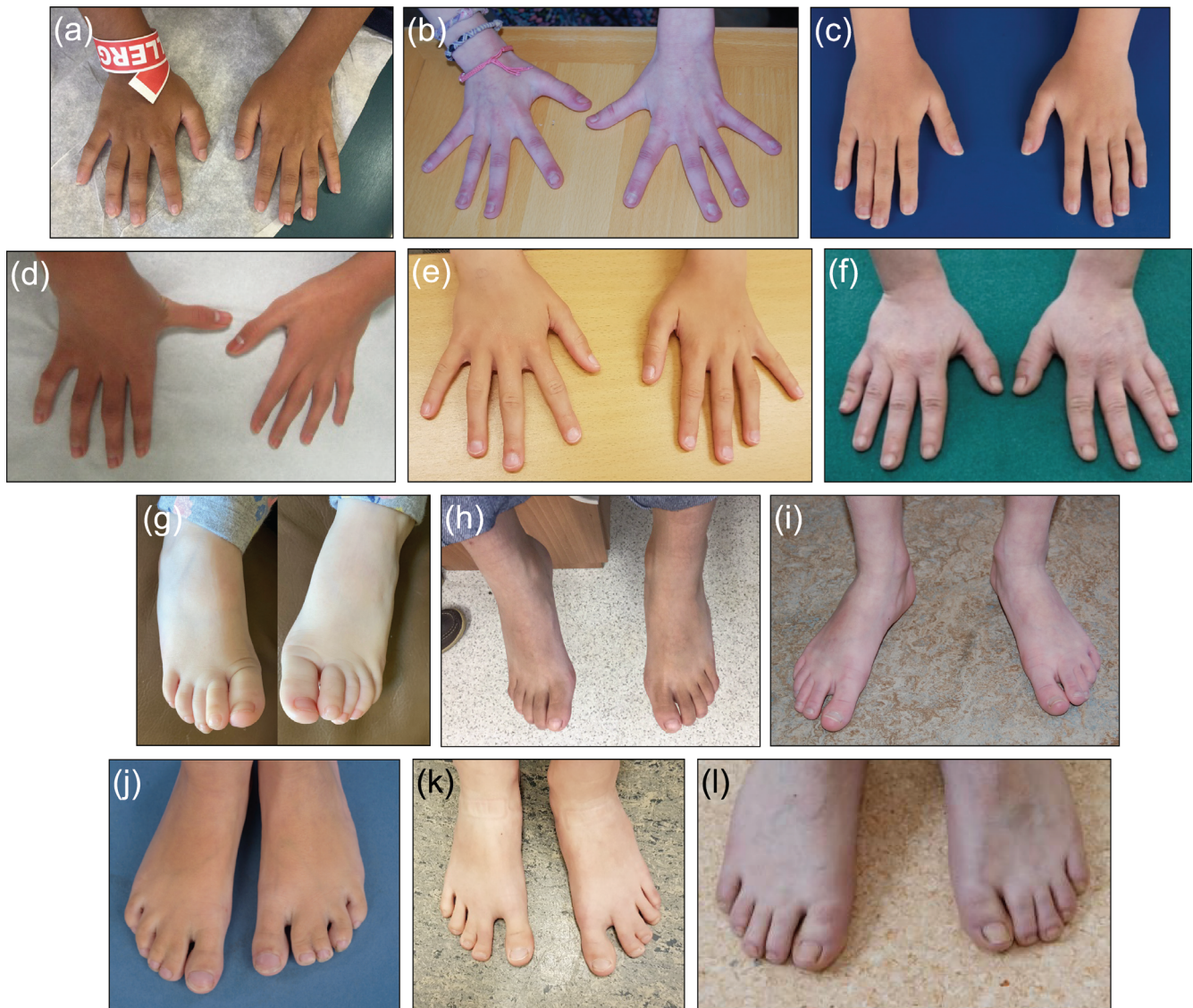
FIGURE 3 (a) Patient 12, (b) Patient 17, (c) Patient 18, (d) Patient 19, (e) Patient 20, (f) Patient 22, (g) Patient 1, (h) Patient 12, (i) Patient 17, (j) Patient 18, (k) Patient 20, (l) Patient 22. Note the presence of fifth finger clinodactyly (d), sandal gap deformity (i, k) and cutaneous syndactyly (j, k) [Color figure can be viewed at wileyonlinelibrary.com ]

Similarly, we also identified the presence of skeletal abnormalities in 50% (13/26) of individuals, including patients with scoliosis and spinal anomalies, delayed bone age, and limb-length discrepancies. The mechanism for these abnormalities is less clear, though it is presumed that they are also derived from abnormal signaling during embryogenesis similar to the distal limb defects commonly described in these patients. While it is unclear how significant the degree of scoliosis was within individuals, careful examination and monitoring for this clinical finding are also recommended.