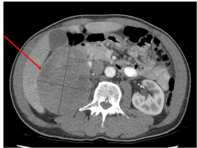
Fig. 2 Abdominal CT scan demonstrating a mass of 13 cm originating from the right adrenal gland in patient 3

Laboratory findings showed elevated inflammatory markers, including an ESR of 94 mm and a CRP of 186.2 mg/L. Furthermore, normocytic anaemia was detected (Hb 7.7 mmol/L, MCV 90 fL), as were thrombocytosis ( 668 \times 10^9/\text{L} ) and leucocytosis ( 17.79 \times 10^9/\text{L} ) (Table 2). Extensive additional testing was initiated, including bacterial cultures, hepatitis viral markers, quantiferon, M-protein, serologic tests for HIV, borrelia and syphilis, and an immunoglobulin panel, which were all negative. Chest and sinus radiography, echocardiography and ECG were normal. However, 18FDG PET-CT scan showed a mass of either the right kidney or adrenal gland. Abdominal CT confirmed that the mass of 13.0 \times 9.5 \times 9.1 cm most likely originated from the right adrenal gland and was suspect for a pheochromocytoma or an adrenal cortex carcinoma (Fig. 2). No metastases were seen on radiological imaging. 24 h urine collection revealed increased excretion rate of metanephrine