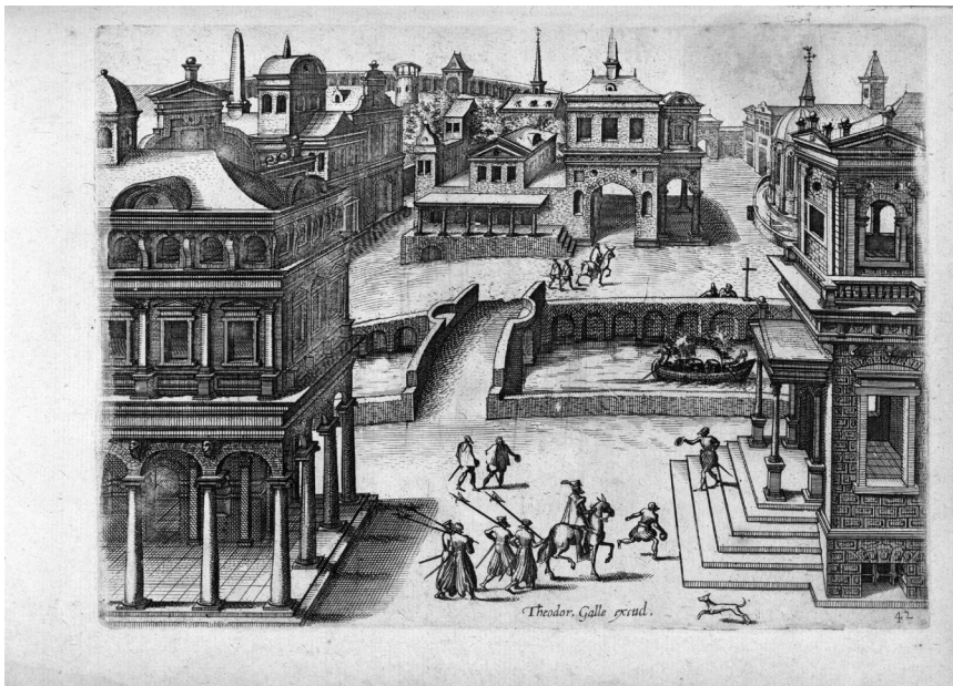
Figure 5.2 Johannes or Lucas van Doetechum after Hans Vredeman de Vries, 'View on a city with palaces and canal from a bird's eye perspective', as published in Variae Architecturae formae (Antwerp: Theodoor Galle, 1601). Rijksmuseum Amsterdam, Public Domain.