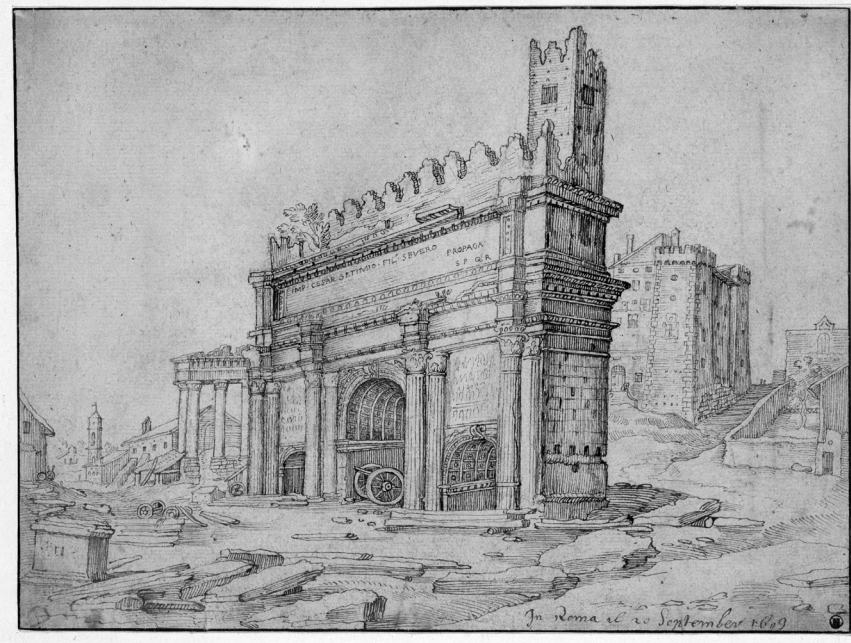
Figure 5.9 Willem van Nieulandt (II), The Arch of Septimius Severus , 1609, drawing, pen and brown ink over black chalk, 20.2 × 27 cm. Kupferstichkabinett Staatliche Museen zu Berlin.

his cityscapes of the Louvre are still preserved. I consciously call them ‘cityscapes’ and not ‘portraits’, since these paintings can be situated in the ‘prehistory’ of the portraits of buildings. They are an early step in the direction, but not yet a portrait, as they do not yet depict the Louvre as if it is a person or as if it has human characteristics.