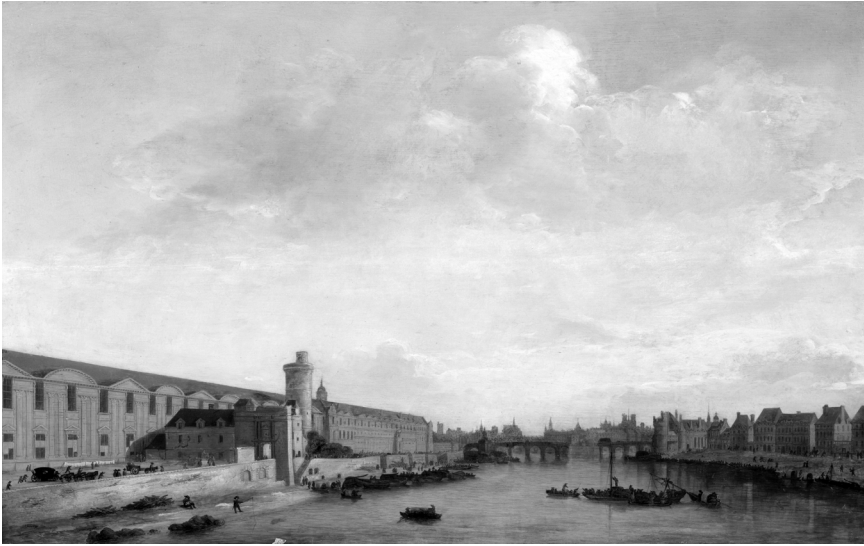
Figure 5.10 Abraham de Verwer, The Louvre Grande Galerie, view of Paris from the Barbier bridge , c. 1640, oil on wood, Musée Carnavalet.