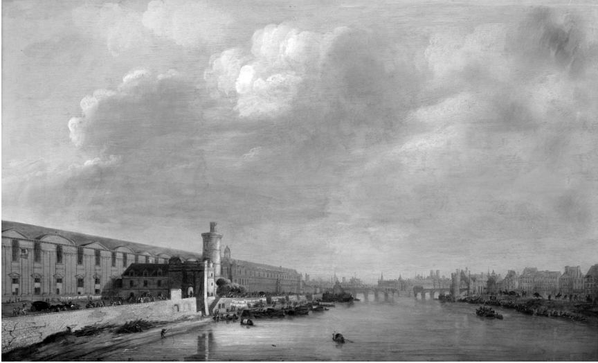
Figure 5.12 Abraham de Verwer, The Louvre Grande Galerie, view of Paris from the Barbier bridge (upstream) , c. 1640, oil on wood, Musée Carnavalet.

be a major element in the development of the portrait of a building by vedute painters among others, but these experiments would culminate in the portraits of Rouen Cathedral painted by Claude Monet at the end of the nineteenth century.