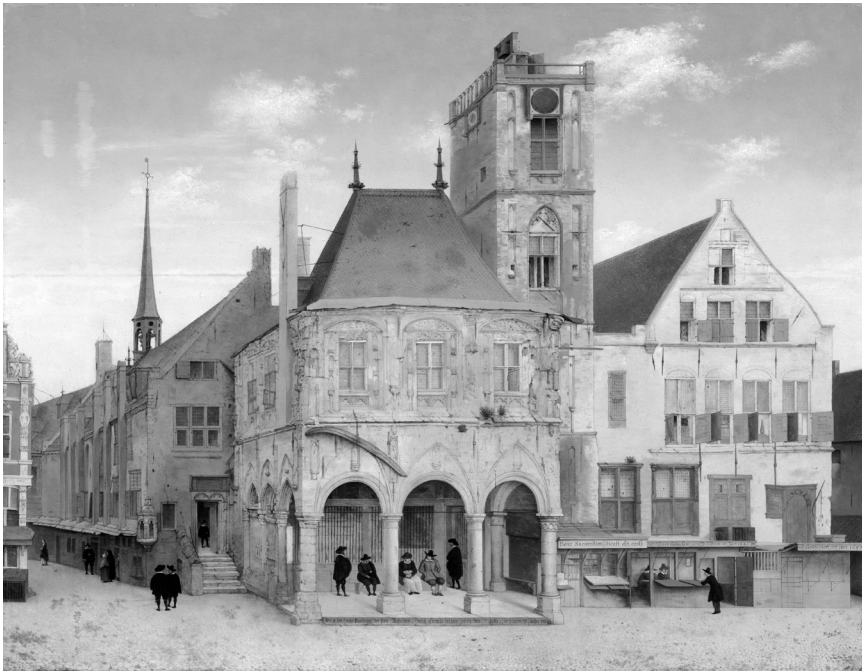
Figure 5.8 Pieter Saenredam, The Old Town Hall of Amsterdam , 1657, oil on panel, 65.5 × 84.5 cm.

One portrait of the old Town Hall plays an important role in the idea of resurrection under God's protection. The painting was done by Pieter Saenredam, who actually painted it years after the actual fire (Figure 5.8). Recently, Lorne Darnell has argued that the Burgomasters had the painting put in their room, right in front of Huygens' poem engraved in marble. Because of this position we can see Saenredam's painting as a pendant of the poem, as if both were in conversation. 33 In his poem Huygens speaks about the eighth and ninth Wonder of the World; or the new Town Hall and the Town Hall that eventually would replace the latter if destroyed. In his painting, Saenredam portrays the old Town