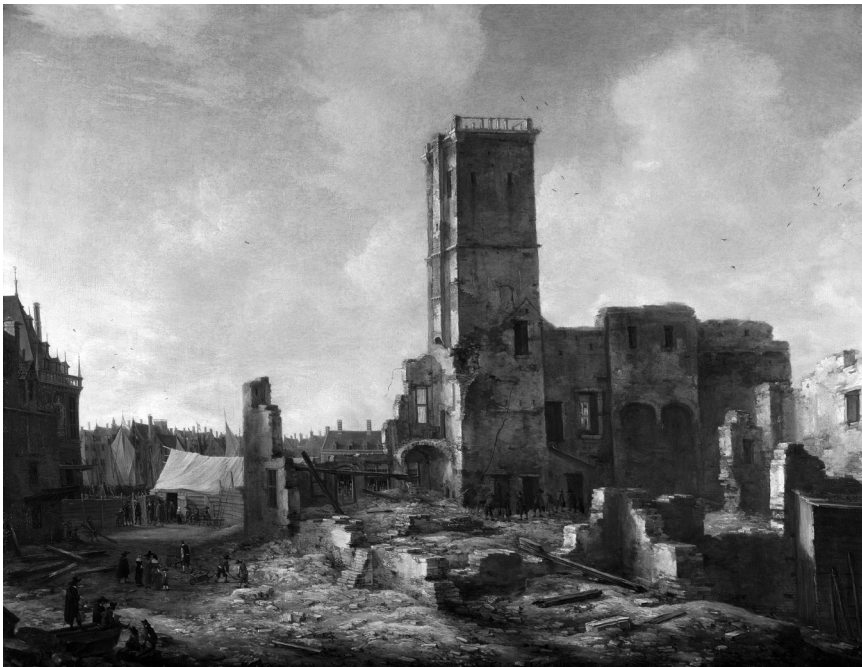
Figure 5.7 Jan Beerstraaten, Ruins of the old Town Hall , c. 1660, oil on canvas, 110 × 145 cm.

The fire was depicted time and again in countless images, such as a painting by Jan Beerstraaten (1622–66) (Figure 5.7). 27 It is an accurate topographical document that can be localized within inches, thus memorializing a ruin that had to be demolished to make way for the new Town Hall. Only thanks to the burning and demolition could Amsterdam show herself in renewed glory. Beerstraaten visually preserves the old splendour of the city, as the painting can be placed within the widely spread aesthetic appreciation of ruins of that time. 28 The frontal view and the emphasis on the horizontal and vertical lines, the sober colours with