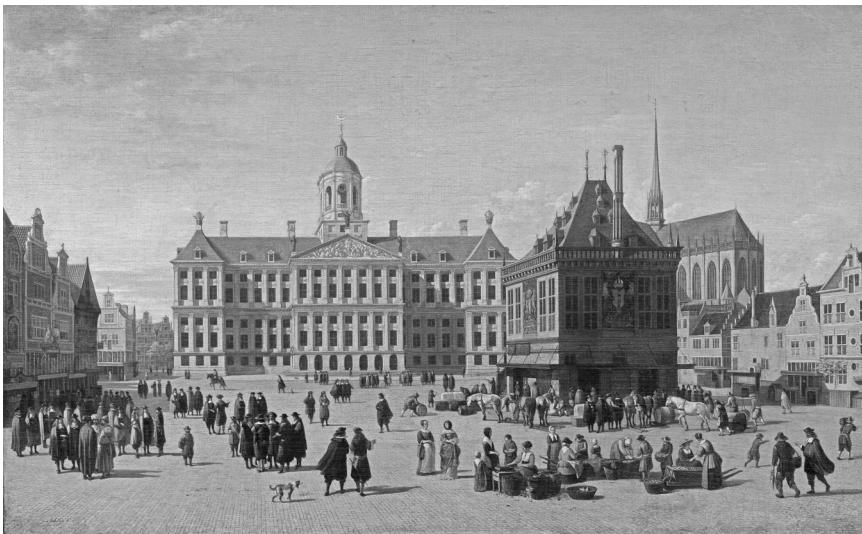
Figure 5.3 Gerrit Adriaensz. Berckheyde, The Town Hall on Dam Square , 1668, oil on canvas, 70 × 110 cm. KMSKA, photo: Hugo Maertens, Public Domain.

Berckheyde uses painterly techniques to the full in order to visualize this monumentality. Next to this central building, there are two other buildings that define the view on Dam Square, the Weigh House and the New Church. The painter places the Weigh House in a deep shadow while he throws full light and a varied shadow on the façade of the Town Hall. He makes the most of the whiteness of the latter's façade by contrasting it with the dark stone of the former. The painter enhances the prominence of the corner and middle bays by bringing them further forward than they are in the actual building. He also carefully represents the colossal Composite columns running over two floors, as well as the grand festoons in between the floors. This all results in a rich play of