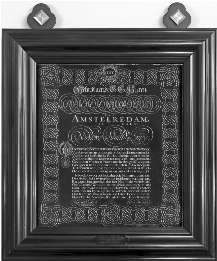
Figure 5.4 Elias Noski, stone engraved with Huygens' poem, 1660, ebony, gilding and black marble, 100 × 90 cm, Amsterdam Museum, Courtesy Stichting Koninklijk Paleis Amsterdam. © The Royal Palace of Amsterdam, photograph: Tom Haartsen.

a drawing by Jacob van der Ulft (1621–89) from 1653 (Figure 5.5). While the similarities are remarkable, on the drawing the tower of the New Church is much higher than in Berckheyde's portrait. The artist visualizes the plans of the so-called 'religious faction' within the Amsterdam municipality headed by Burgomaster Willem Cornelis Backer (1595–1652). He wanted to crown the New Church with the highest tower in the Dutch Republic to increase God's