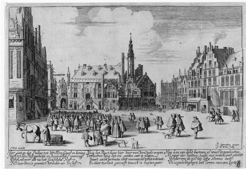
Figure 5.1 Jan van de Velde after Pieter Jansz. Saenredam, 'View on the Grand Square with Town Hall of Haarlem', as published in Samuel Ampzing, Beschryvinge ende lof der stad Haerlem (Haarlem: Adriaen Roman, 1628). Rijksmuseum Amsterdam, Public Domain.