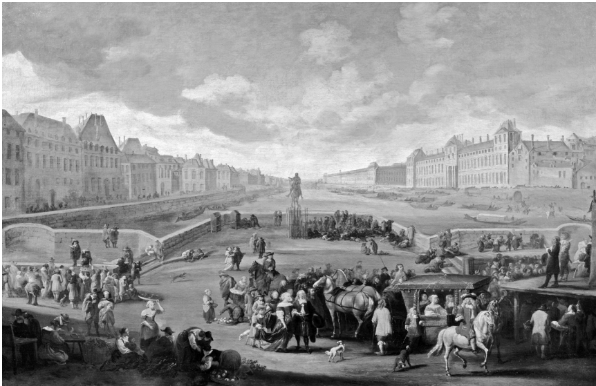
Figure 1.7 Hendrick Mommers, View of the Louvre from the Pont-Neuf , c. 1665, oil on canvas, 90 × 110 cm. RMN, Musée du Louvre. © 2020, photo Josse/Scala, Florence.