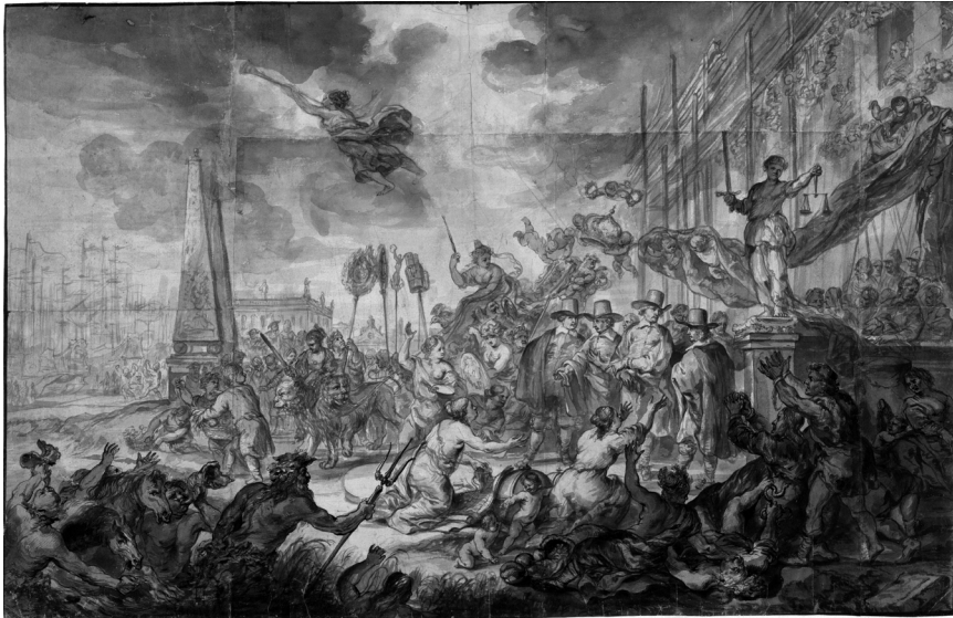
Figure 1.4 Jürgen Ovens (?), Entry of the Amsterdam Burgomasters , c. 1662, black crayon, pencil in black and brown, d. 70.22 cm.

In the imagery of the Town Hall, the magnificence of Amsterdam and her rulers is nowhere more explicitly visualized than in a drawing attributed to Jürgen Ovens (1623–78), an artist from the German city of Tönning who came to live in Amsterdam around 1640 (Figure 1.4). 28 On Dam Square, where the Town Hall is under construction, the Amsterdam City Maiden is seated on a triumphal wagon pulled by a pair of lions. A multitude of ancient gods and allegorical figures accompany her. We would relate these figures far more quickly to Counter-Reformatory Rome or the Southern Netherlands than to the Calvinistic Republic. Nevertheless, the artist explicitly connects the Baroque triumph of the City Maiden to the four Burgomasters at whom she looks. The Burgomasters are in full conversation while one of them ostentatiously holds a purse. Chained men and kneeling women beg Amsterdam's rulers for their attention. Between these supplicants, Abundance with her horn of plenty suppresses Envy and her serpent. Amsterdam luxuriates in her extreme wealth. Her rulers ensure that this wealth is spent carefully in their liberality and help for people in need. The Town Hall, which has already advanced to the first floor, from where people are looking at the triumphal parade through the windows, shows their magnificence.