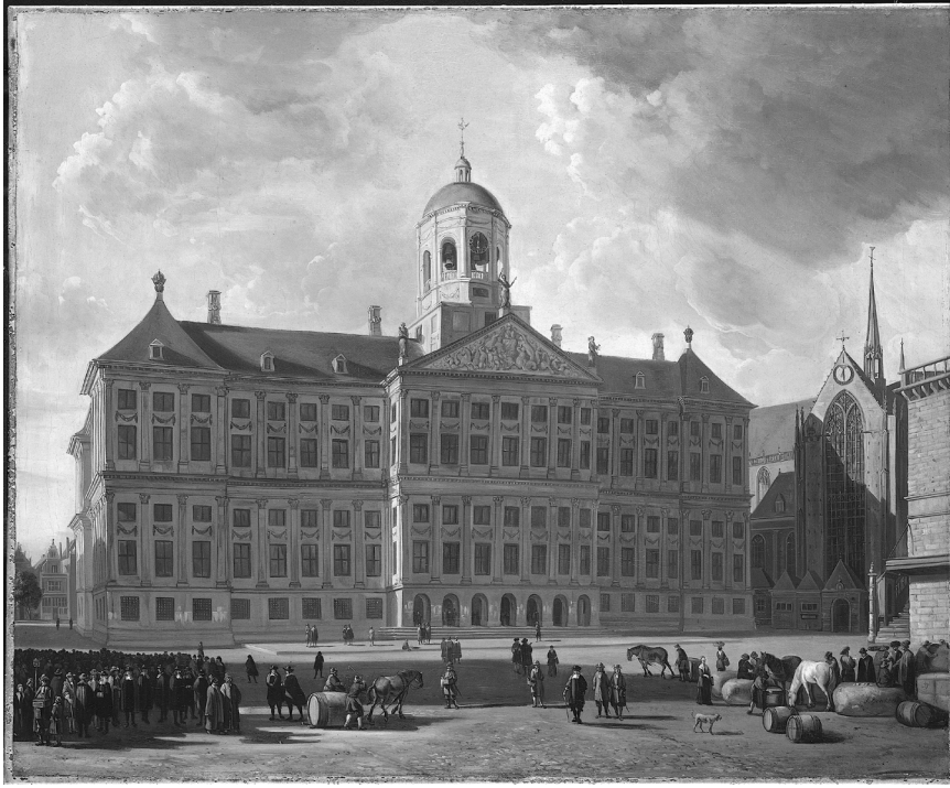
Figure 1.5 Gerrit Adriaensz. Berckheyde, The Town Hall on Dam Square , 1665–80, oil on canvas, 75.5 × 91.5 cm. Loan from Netherlands Institute for Cultural Heritage (ICN), Rijswijk/Amsterdam on loan to Amsterdam Museum, Public Domain.

Many figures appear to look at the Town Hall, and are dressed in black, except the two men in the front who stand out with their colourful, exotic costumes. They illustrate that Amsterdam is a booming metropolis attracting varied, international visitors. The dark group seems to topple into a dark puddle of water, falling into nothingness in front of the monumental building.