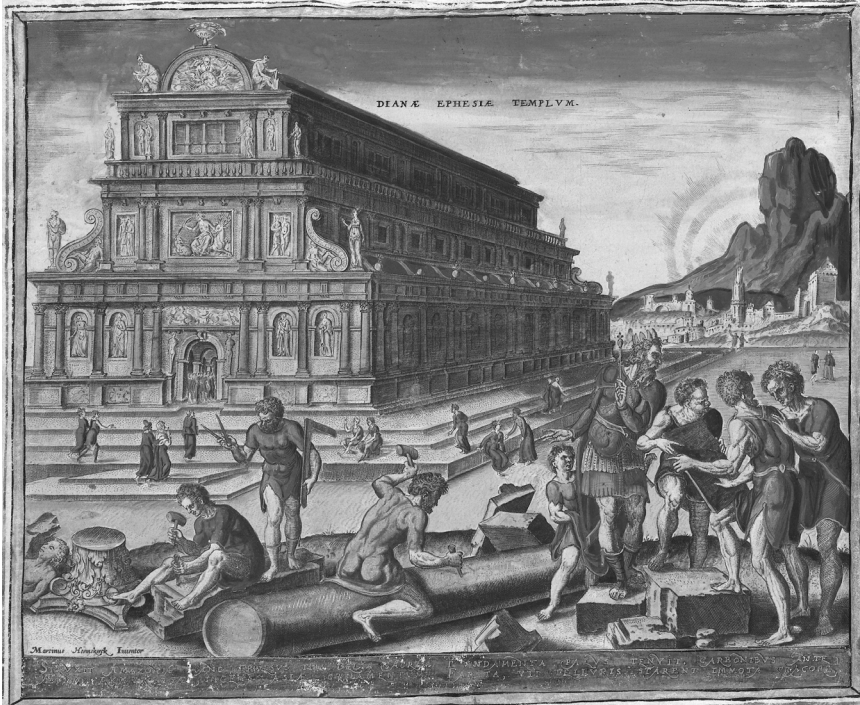
Figure 1.9 Philips Galle after Maarten van Heemskerck, The Temple of Diana at Ephesus , 1572, engraving, hand-coloured, 211 × 258 mm. Rijksmuseum Amsterdam, Public Domain.

exception. Such praise became so popular that it was soon a fixed topos and even today figures in travel accounts of Amsterdam, such as those posted on TripAdvisor. 34 To give the topos maximal persuasiveness, poets exhausted themselves in creativity. In the lengthy laudatory poem that Vos made for the inauguration, he wrote ‘This wonder that makes the eye of wonders wonder’, using the rhetorical device of employing as many meanings and declensions of the same word as possible in one sentence.