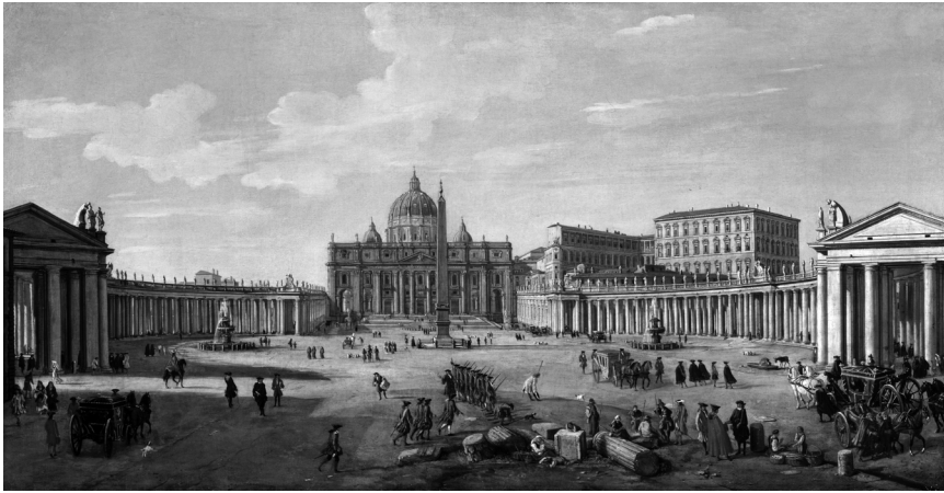
Figure 1.6 Casper van Wittel (alias Vanvitelli), View of St. Peter's Square , c. 1700, oil on canvas, 44.5 × 84.2 cm.

colonnade (Figure 1.6). In Paris, decades earlier, a far less famous Dutch painter, Hendrick Mommers (1619–93), used related strategies in his paintings of the Grande Galerie of the Louvre and the Amsterdam Town Hall (Figures 1.7 and 1.8): light and dark effects emphasized the radiance of the buildings, contrasting with the everyday scenes in front of them, while the distortion of perspective