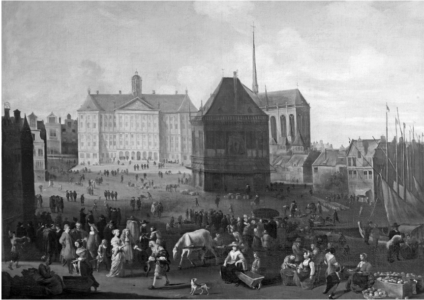
Figure 1.8 Hendrick Mommers, Market Scene before the Dam , c. 1665, oil on canvas, 84.5 × 120.7 cm. Dyrham Park, Gloucestershire, courtesy of the National Trust.

exaggerating their vastness. The Louvre becomes a revelation of the infinite because perspective is manipulated to make the Grande Galerie extend to the horizon. The Town Hall emerges in his hands as supernatural manifestation in the middle of human hustle and bustle.