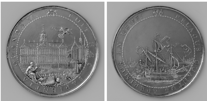
Figure 1.3 Jurriaan Pool, silver medal commemorating the inauguration ceremony of the Amsterdam Town Hall, 29 July 1655, d. 70 mm.

The texts and images celebrating the Town Hall are far from neutral. They give us a privileged insight in what the Burgomasters wanted their building to bring about. Poets often received handsome compensation for their efforts. For instance, the Burgomasters gave Vondel 'a silver cup or plate' ( een silvre kop of schaal ) for the extensive poem he wrote for the inauguration. 22 Often patrons and poets worked to mutual benefit. The equally comprehensive poem written for the inauguration by Jan Vos (1612–67) would have come as no surprise, given Vos was not only an extremely successful playwright of bloody tragedies, but a glass maker as well, who had received a huge commission as part of the Town Hall's completion. 23 In the case of Huygens, we can see his poems as a diplomatic