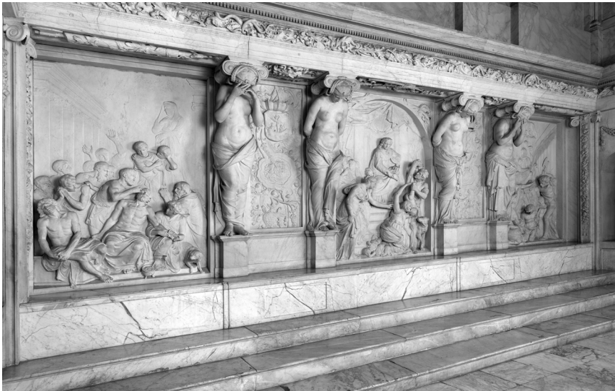
Figure 1.2 The Tribunal.