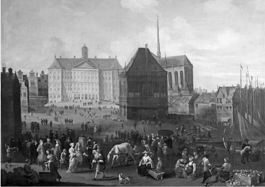
Figure 1.8 Hendrick Mommers, Market Scene before the Dam , c. 1665, oil on canvas, 84.5 × 120.7 cm. Dyrham Park, Gloucestershire.

exaggerating their vastness. The Louvre becomes a revelation of the infinite because perspective is manipulated to make the Grande Galerie extend to the horizon. The Town Hall emerges in his hands as supernatural manifestation in the middle of human hustle and bustle.