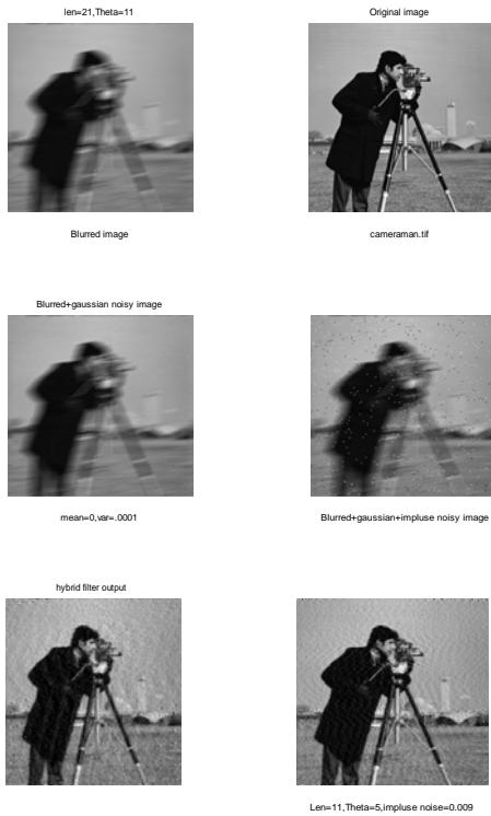
Fig.2 Original Image Fig.3 Blurred image with Len=21, Theta=11 Fig.4 Blurred image with gaussian noise of mean=0, variance = 0 .001

The Original Image is cameraman image . Adding three types of Noise (Additive white Gaussian noise, Salt & Pepper noise blurredness) and pass this image to our hybrid filter we get the desired result. The result depend upon the blurring angle (theta) and the blurring length (Len) and the intensity of the impulse noise. The performance is compared with the MSE & PSNR of the original image and the filter output