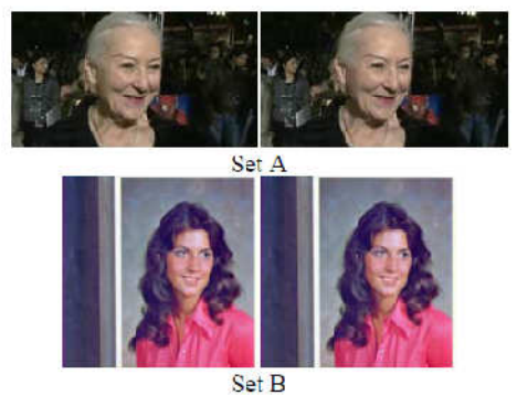
(left) Original test images and (right) Stego images