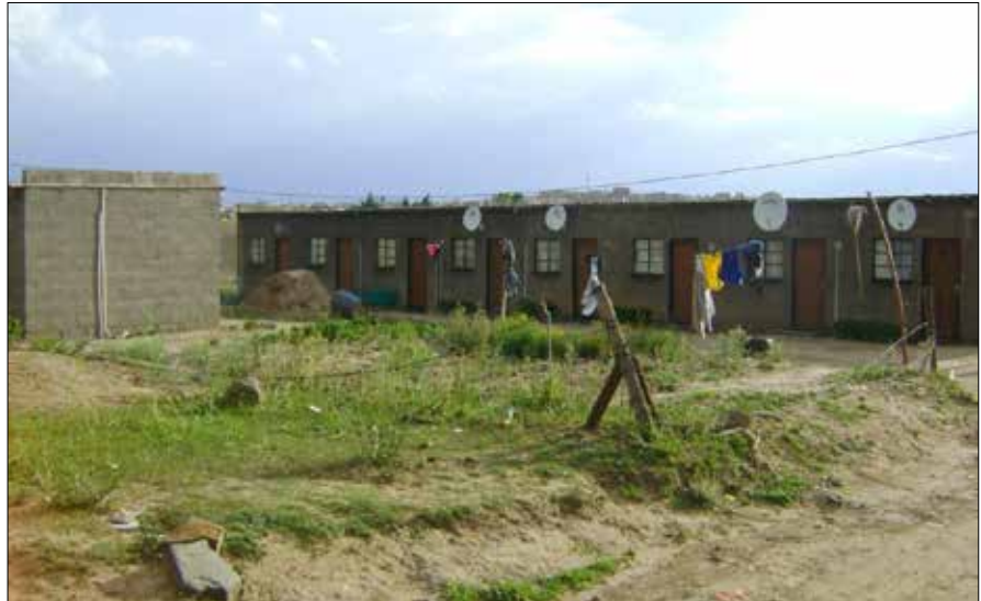
Figure 4: Housing units built for rent to workers in AGOA factories

Interviewees also pointed out that, in some instances, local authorities had provided street lighting on the access roads to the factories, primarily for the benefit of the workers, but also for the inhabitants of the settlements, and security guards at the informal