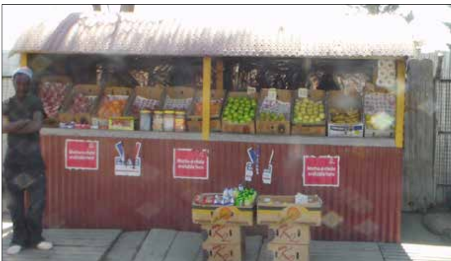
Figure 3: Informal trading in semi-permanent structures focused on workers in AGOA factories