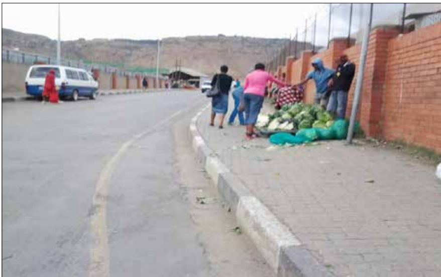
Figure 2: Street-level informal trading focused on workers in AGOA factories

The spatial development planners who were interviewed indicated that they had investigated what they regarded as “innovative ways of managing the haphazard development of the settlements” once the AGOA factories had been built. They had, among others, looked into alternative sites for settlement expansion and construction of factories, and for ways in which they could upgrade existing settlements where the factories had been built. They pointed out that the latter turned out to be the most likely option, due to inadequate funds and the general lack of political will for planning in local authorities. They argued that this had resulted in the illegal use and development of land that had continued unabated, and that the already huge backlogs in service provision just kept on growing and getting worse in those areas where there are severely stretched services. They added that, in some instances, houses had been illegally built in road reserves, making pedestrian movement difficult, posing health