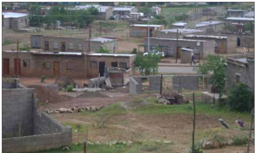
Figure 5: Unplanned, unregulated spatial development close to AGOA factories

market stalls. In general, however, there was a shared view that local authorities had not capitalised enough on, or benefitted enough from the presence of the AGOA factories, and had not used this platform to extend and upgrade services to the rest of their areas of jurisdiction. In defence of the local authorities, several of the interviewees indicated that, because AGOA had not led to broad-based economic growth, the continuing high poverty levels meant that many households still could not afford to pay for municipal services. They argued that this was the reason for the gaps and backlogs in service provision by the local authorities. One of the interviewees, who held this view, noted that, where