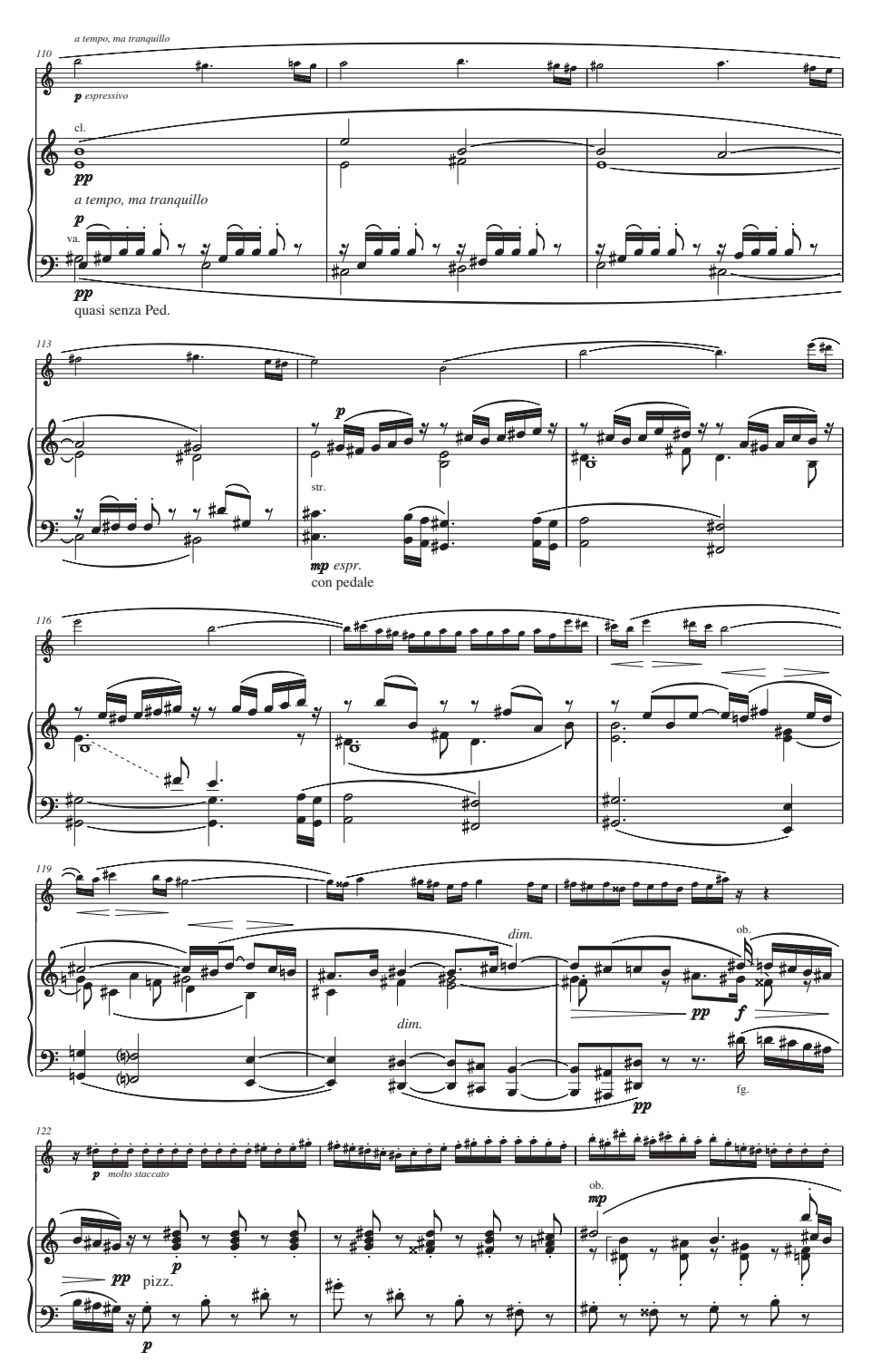
Ex. 5. Nielsen, Concerto for Flute and Orchestra, first movement, bb. 110-124 ('Arcadian Theme')