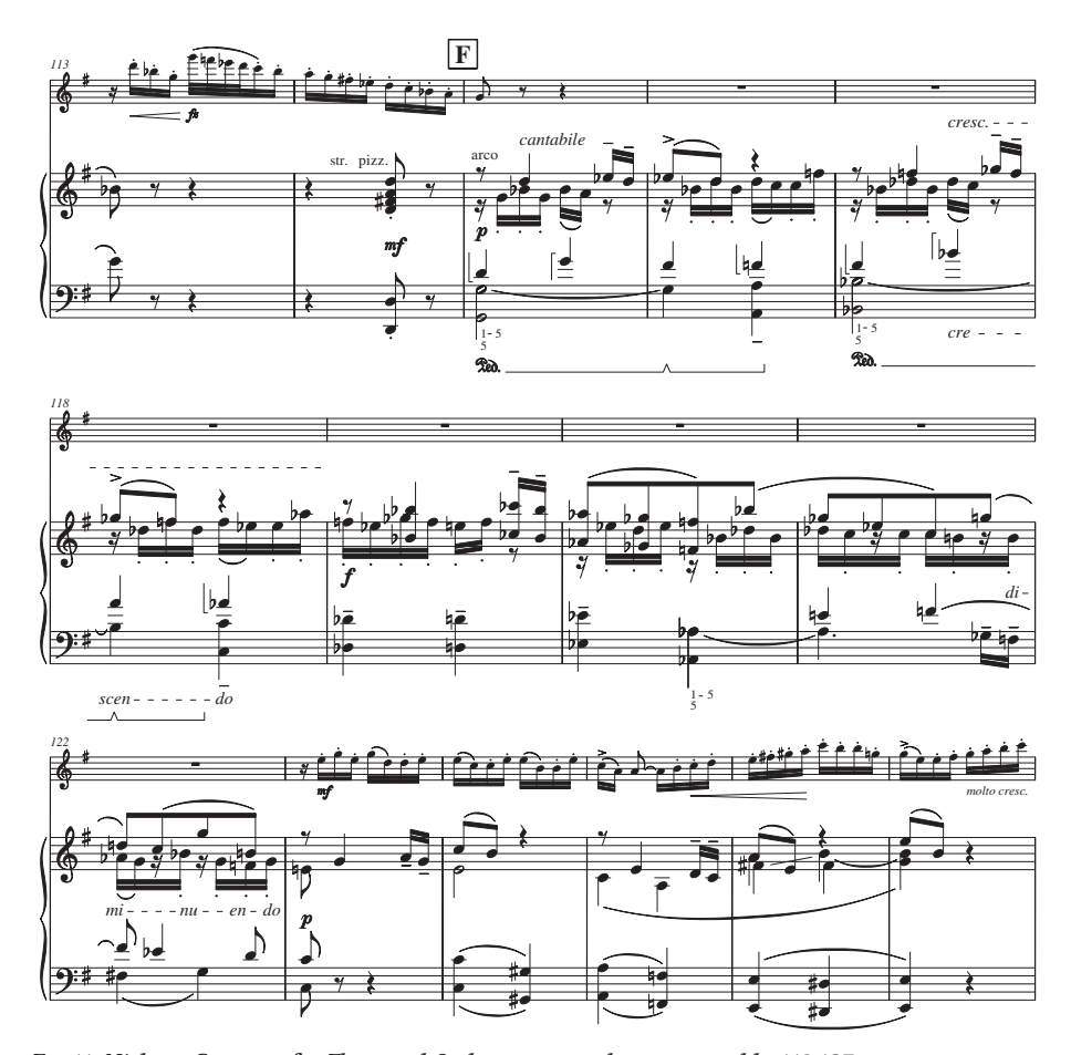
Ex. 11. Nielsen, Concerto for Flute and Orchestra, second movement, bb. 113-127

the events depicted in Ex. 10 , we soon sense that it is in danger of losing the battle with those darker, 'troubled present' forces. Here there is a conspicuous lack of stable harmonic accompaniment compared to the theme's earlier statement. Instead, horn, violins, and solo viola work to pressure the flute's melody rather than support it. The increase in accidentals, trills, and dynamics work to both break down the theme's stability and G major harmonic center, and presage another unsettling arrival to come. But first there occurs an interruption in the form of a volatile, nervously lyrical orchestral interlude.