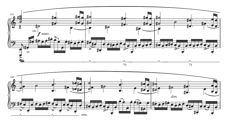
Ex. 6. Nielsen, Concerto for Flute and Orchestra, first movement, bb. 101-106

The theme returns only partially two more times in the movement, on both occasions in contexts that compromise its character as established in the only full appearance discussed above. The first instance arrives well into the flute's lengthy cadenza toward the conclusion of the movement, where the clarinet has assumed the prominent role of a secondary solo presence. The two instruments take brief turns playing a short incipit of the melody amidst angular, dissonant virtuoso passage work played by the other. It is difficult not to view this as an important contrast wherein each instrument attempts unsuccessfully to resurrect the theme in the face of the other's unrest.<sup>31</sup> See Ex. 7.