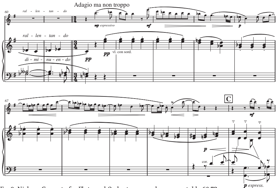
Ex. 9. Nielsen, Concerto for Flute and Orchestra, second movement, bb. 60-72