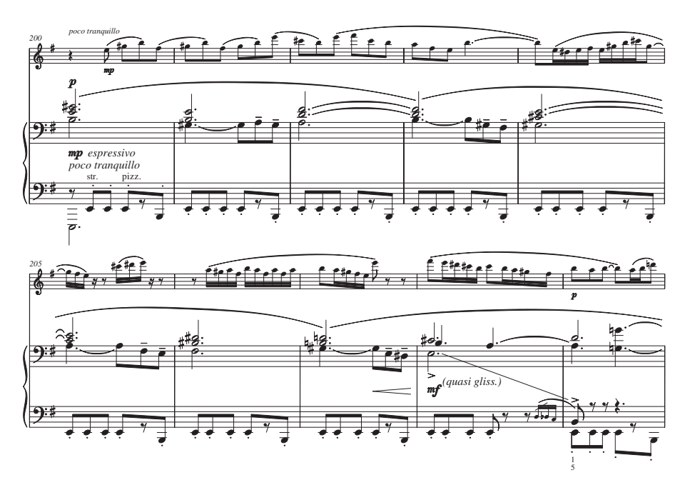
Ex. 14. Nielsen, Concerto for Flute and Orchestra, second movement, bb. 200-209

This is reprised by the flute approximately a dozen bars later over spare accompaniment, followed by some energetic banter between soloist and ensemble beginning at b. 161. The clearest indication that the concerto will end in a spirit of gentleness and humor, and that the 'lamenting and maliciousness' will not return, arrives at b. 200. Here the tempo marking reads Poco Tranquillo . A very similar tempo marking also using the word Tranquillo had ushered in the simple Arcadian theme from the middle of the first movement. This is the cue for that theme to enter with the trombone under what may impress listeners as a pastoral dance in the flute and orchestra. The soft dynamics lend to a feeling of repose. See Ex. 14. The playful nature of the dialogue between the flute, trombone, and orchestra that follows, and that concludes both movement and work, perhaps suggests that now the ensemble of instrumental characters has made peace with the notion that Arcadia will never be truly regained. Rather, they content themselves with the memory of past innocence with a smile and laugh in the trombone.