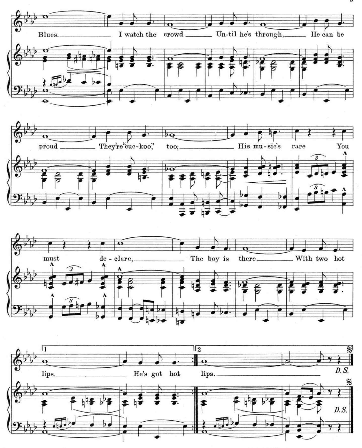
"Feist" Songs are also obtainable from your Dealer for your Talking Machine or Player Piano and for Band, Orchestra, etc.