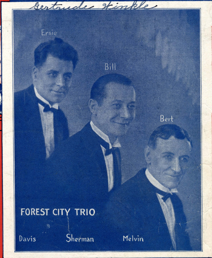
FOREST CITY TRIO