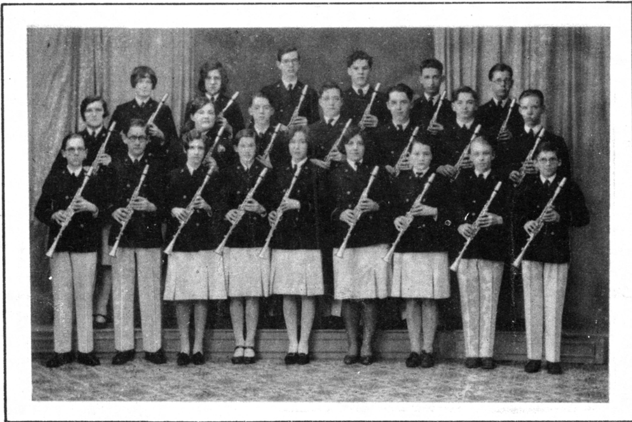
CLARINET SECTION OF THE LOCKPORT HIGH SCHOOL BAND WITH Silva-Bet CLARINETS