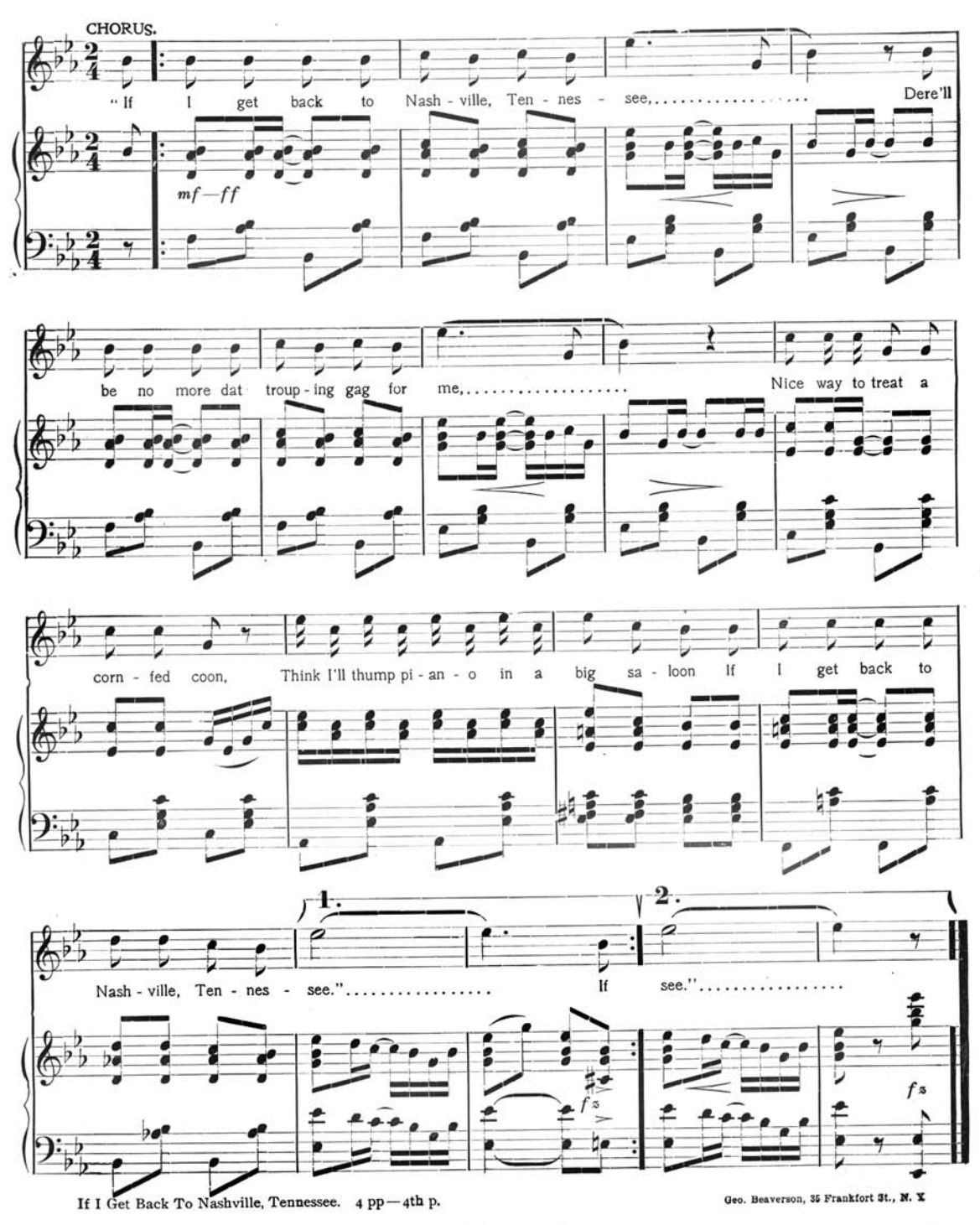
FOR SALE AT ALL MUSIC STORES.