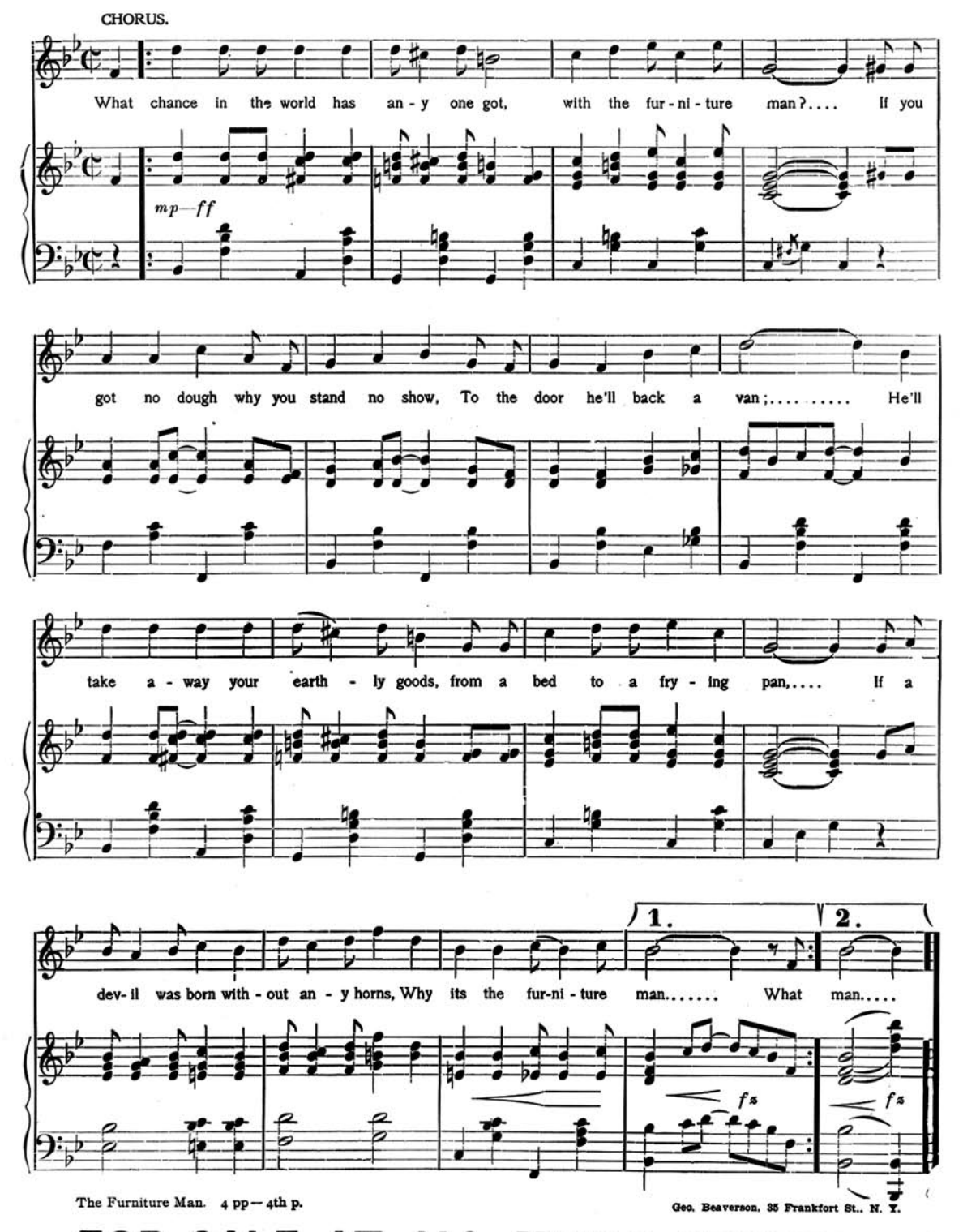
FOR SALE AT ALL MUSIC STORES.