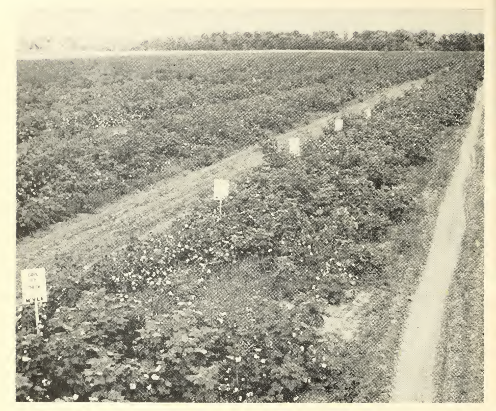
Figure 2. The effect of nematocide treatment on control of the Fusarium wilt-nematode complex. In the foreground is a plot without nematocide treatment, behind this are plots treated with: 1 gallon of Nemagon, 8 gallons of D-D, and ½ gallon of Nemagon respectively. In each plot the variety is Deltapine 15.