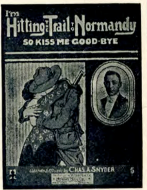
The Song Everybody is Singing