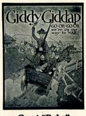
Great "Rube" War Song Hit

Complete Copies on Sale Wherever Music is Sold!