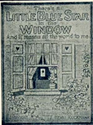
The Popular "Service Flag" Song Hit