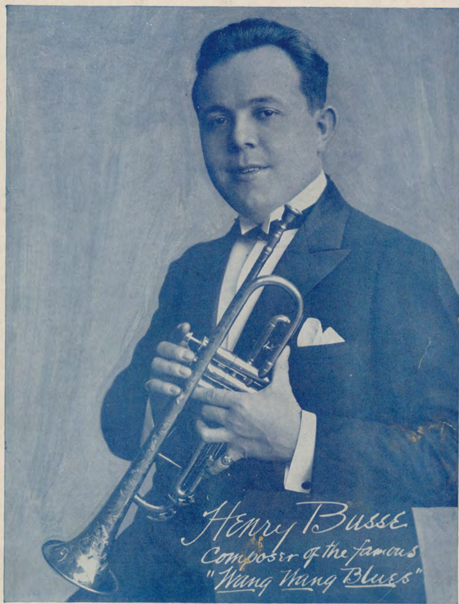
Henry Busse Composer of the famous "Wang Wang Blues"