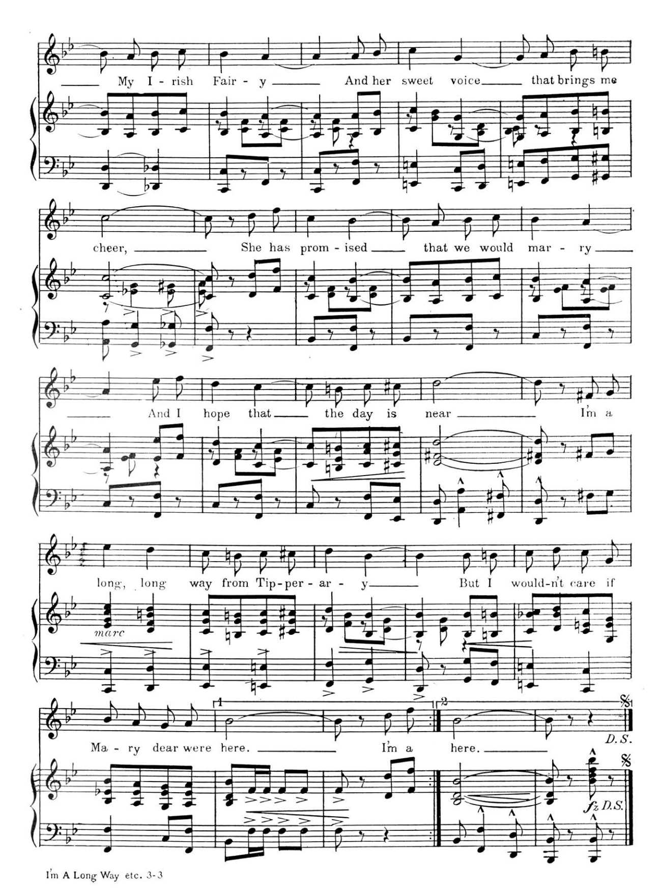
FREE! A miniature DREAM BOOK (A Dictionary of Dreams) Sent to anyone sending us the names and address of 3 or 4 of your friends you think are interested in Popular Sopps and Music and would like our NEW CATALOG of SPECIAL BARGAINS. Write to Will Rossiter, 136 West Lake Street, Chicago.