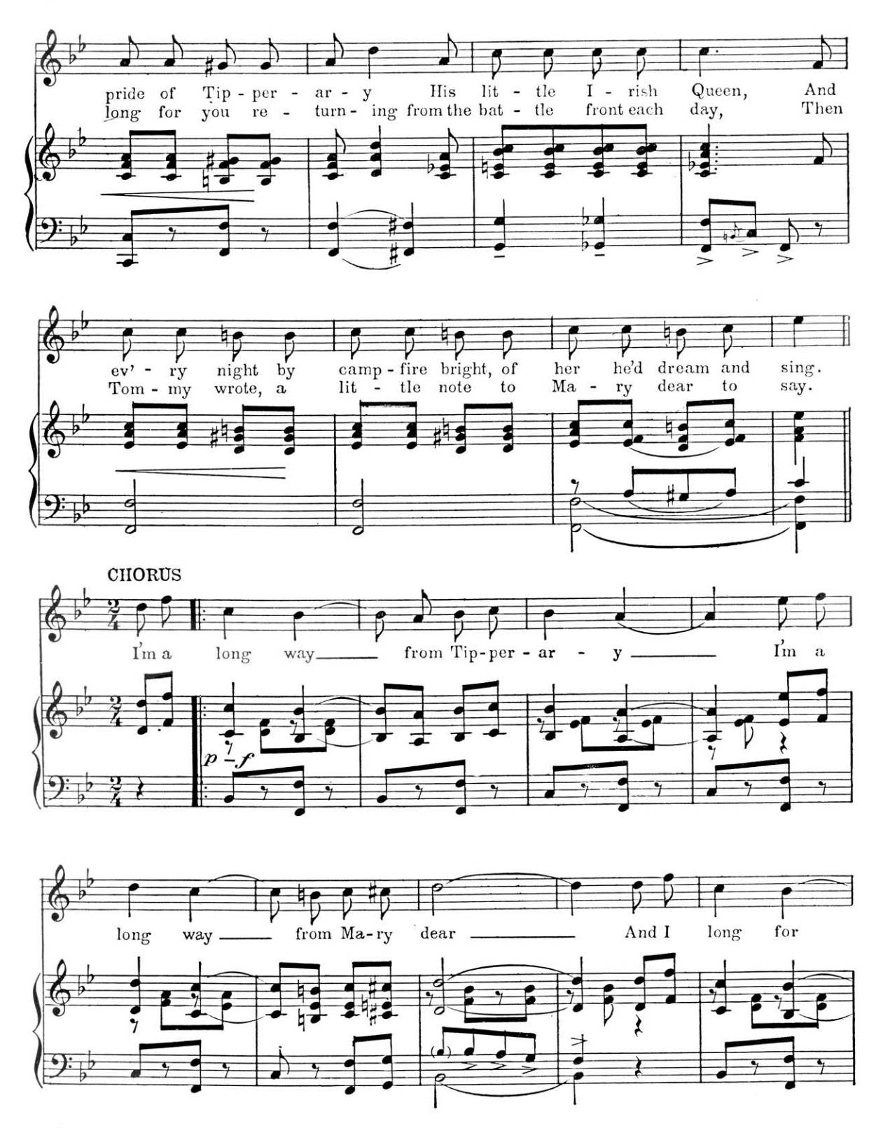
I'm A Long Way etc. 3-2