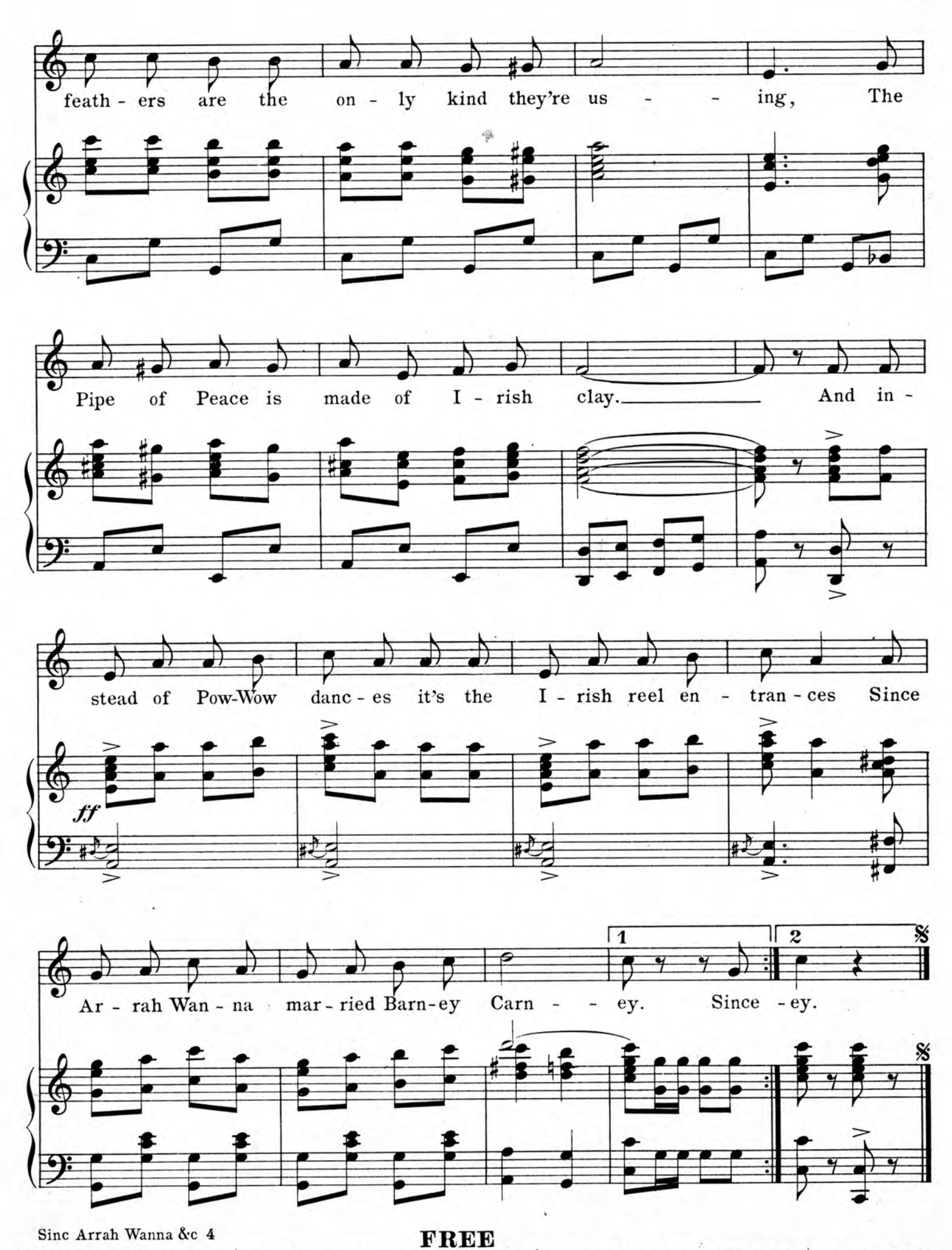
Send your name address and 24 stamp for postage and receive four handsomely engraved souvenir post cards. F. B. Haviland Pub. Co. 125 West 37th St; N.Y. TELLER, SONS&DORMER. NEW-YORK.