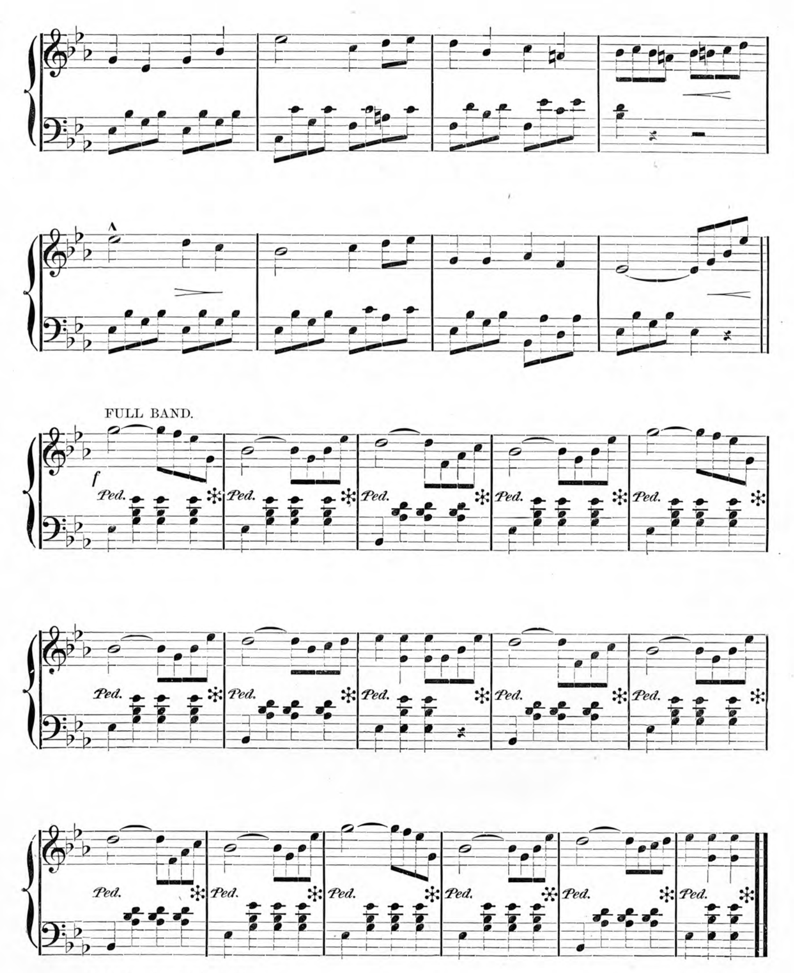
The Celebrated Scottish Band March.—5.