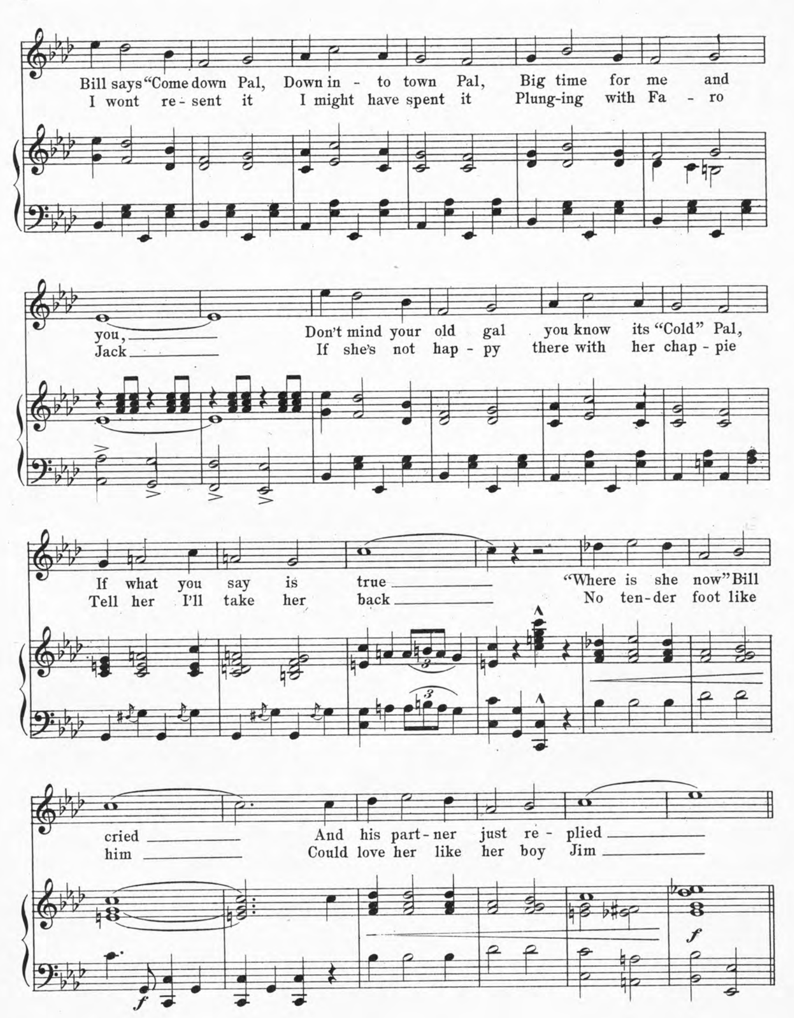
San Antonio. 3