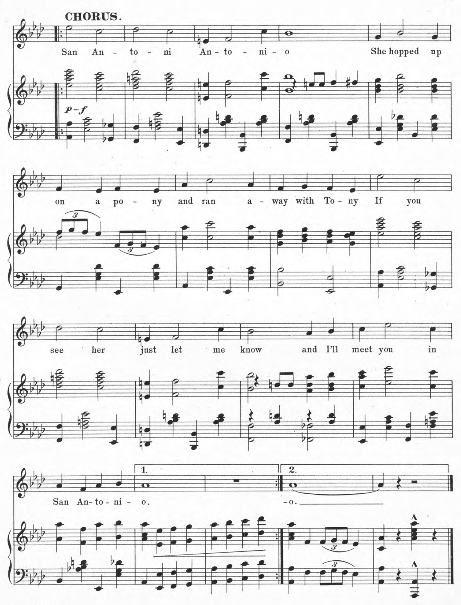
San Antonio. 3