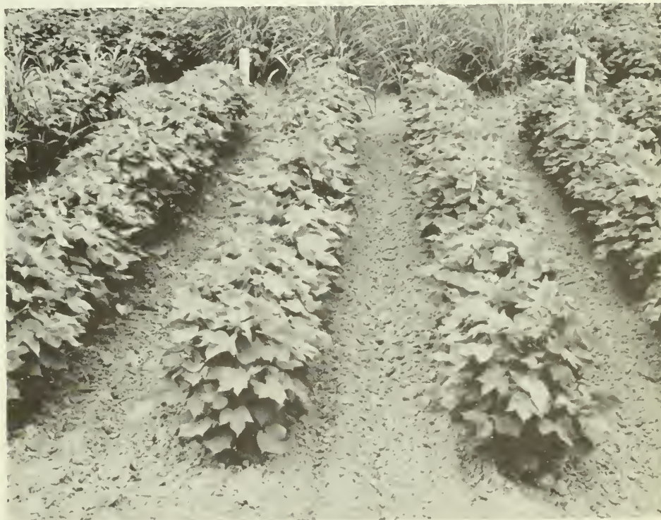
Figure 4. Treflan (same as in 3 above). MSMA (same as in 2 above).