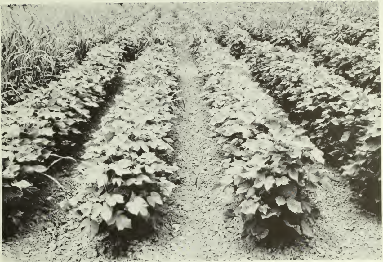
Figure 5. MBR 18337 0.5 LB/A Over-the-Top 6" JG 6-10-78 + repeat 7/13 and 12" JG 6/5/79 + repeat 7/6 Picture — July 17, 1979.