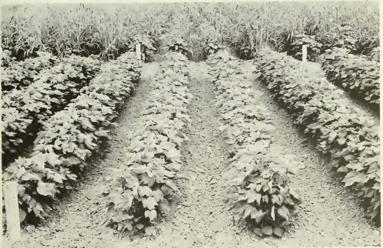
Figure 6. Treflan (same as in 3 above). MBR 18337 (same as in 5 above). Picture — July 17, 1979.