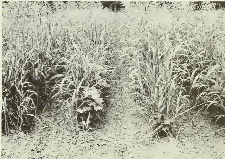
Figure 2. MSMA 0.7 Over-the-Top + cultivation. MSMA applied OT 2" cotton 5/27/77+ repeat 6/2 OT 2" cotton 5/29/78. OT 6" cotton 6/5/79.