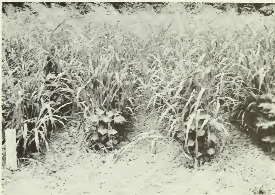
Figure 1. No Herbicide, only cultivation (for 3 years).

Main plots were 16 rows (40 inches wide and 30 ft long), and treatments were a check (no herbicide) and preplant application of trifluralin, dinitramine/profluralin, butralin or Dowco 295® in 1976, 1977, 1978 and 1979 (Table 1). Fall-applied herbicides were incorporated 3-4 inches deep by two passes with a four-row tandem disk