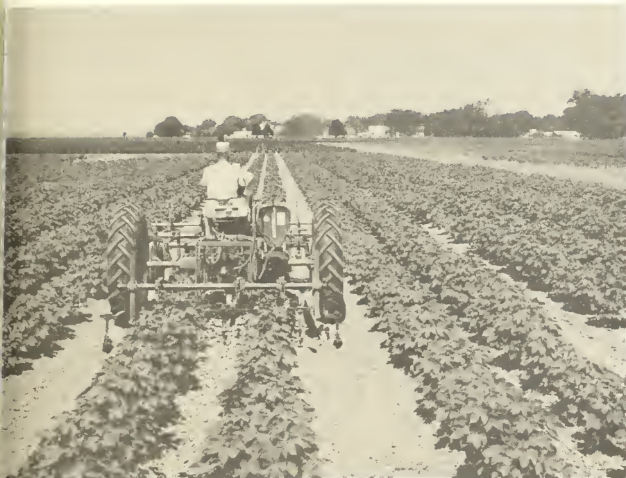
Figure 4. A six row plot consists of three 100-inch beds, each with two paired 40-inch rows of cotton. Here a two-row plot unit cultivates the central wide bed of a six-row plot; tractor wheels travel only in the wide middles.

It is generally agreed that conventional tapered spindle pickers perform very efficiently in harvesting high-yield cotton, with an upper limit of capacity, in low gear, of about 4 bales per acre. The highest yield levels in the Mississippi Delta as yet do not threaten the efficiency of the spindle picker, but low yields do, because: (1) picker efficiency is reduced as yields decline and (2) costs are about the same whether 0.115 pounds per foot of row (one bale per acre, 40-inch rows) is harvested or 0.230 pounds per foot of row (two bales per acre, 40-inch rows).