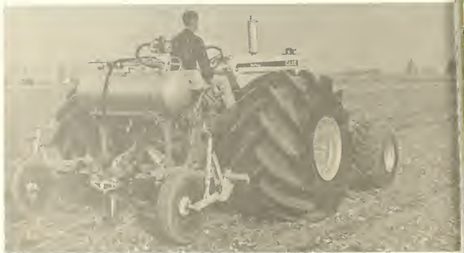
Figure 3. Large floatation-type tires used in early wide-bed studies with a 60-horsepower tractor.

gained in possible field-working days following rainy periods. Wide-bed studies were discontinued in 1966 after the success of these tires was demonstrated in a primary tillage program for wider beds. At this time, soil compaction in the nontilled zone was not considered economically important, but the additional days available for field work by having additional traction and floatation was considered very important. The widespread use of dual rear tires has generally diminished the need for special, "wide," low-pressure tires. Both, however, are adaptable to the wide-bed cultural system and may be used under severe soil conditions for either tillage, spraying, cultivating, or harvesting operations. The wide middles of this cultural system (Fig. 4) allow almost unlimited field traffic, as needed, yet are limited enough to permit cotton plants on good soils to produce at maximum levels.