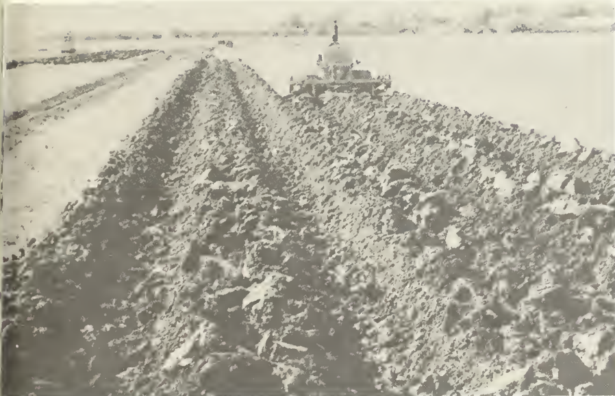
Figure 2. Preparation of "watermelon beds" on Tunica silty clay soil.