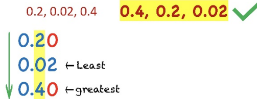
Figure 2: Example of an exercise from the lesson