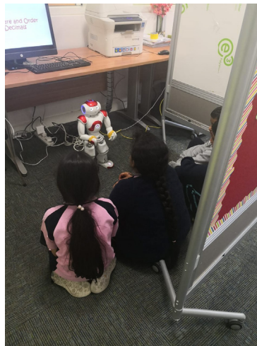
Figure 3: The setup of the robot's review session