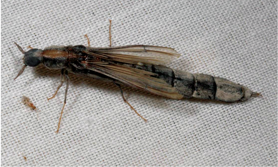
Figure 5. A live example of a very strange beetle belonging to the genus Atractocerus (Coleoptera: Lymexylidae). This insect was photographed and collected at a MVT by B. Howarth in September 2008 in the Emirate of Fujairah and represents a new species and genus record for the UAE.