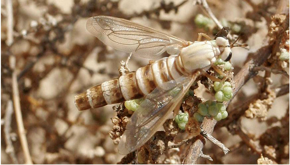
Figure 6. An unidentified fly from the family Mydidae. Whilst Mydidae had been observed in neighbouring Oman, before 2006 no records were known from the UAE.

Nemotelus along with a species of Odontomyia were recorded from the Sharjah Emirate (Howarth 2006, Howarth and Gillett 2008). The latter is the most speciose and cosmopolitan genus in the family and contains well over 200 species that are often found on flowers. The larvae are aquatic and feed on algae at the margins of fresh water (Bayless 2008).