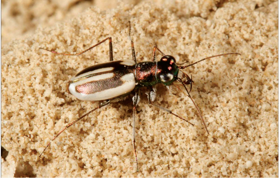
Figure 4. Callytron monalisa . A living specimen of Callytron monalisa , one of two specimens collected by B. Howarth in 2007 on Reem Island, Abu Dhabi. This rare species is known only from the Iranian side of the Arabian Gulf.