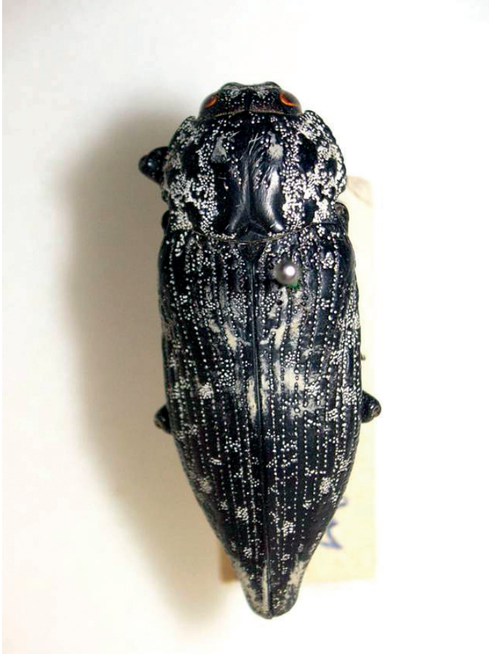
Figure 3. The flat-headed borer jewel beetle, Capnodis excisa . This specimen was collected by J. N. B. Brown in the Madam area, UAE; originally in the Abu Dhabi Collection, it is now housed in the JAAEN-HG Insect Collection in Al Ain.

of the Abu Dhabi ENHG newsletter Focus for November 2007 (ENHG 2007). Even more interesting was the cover photograph purporting to show Julodis euphratica , but which actually shows a different species, which is almost certainly J. candida . If this is correct, then this is the only known photograph of this species and is remarkable in that it not only shows the creamy white pulverulence mentioned above, but also orange-yellow longitudinal stripes along the centre of the pronotum and along the margins of the elytra that are not obvious either in the dead insect (Fig. 1) or the original description by Holyński (1996).