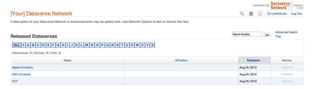
Fig. 1. The simple interface of our DVN design

Ankabut is very keen and ambitious in terms of providing nonproprietary software to the research and educational sectors in the UAE over its dedicated network. It must consider cross-platform issues, the high cost of licensing products and the adoption of OSS standards as a framework to deliver high quality services. Ankabut has shown a great deal of interest in collaborating with us on the proposed DVN project. They have shown their willingness to contribute, in terms of operational management, connectivity, deployment and data management, as well as providing central data repository. а