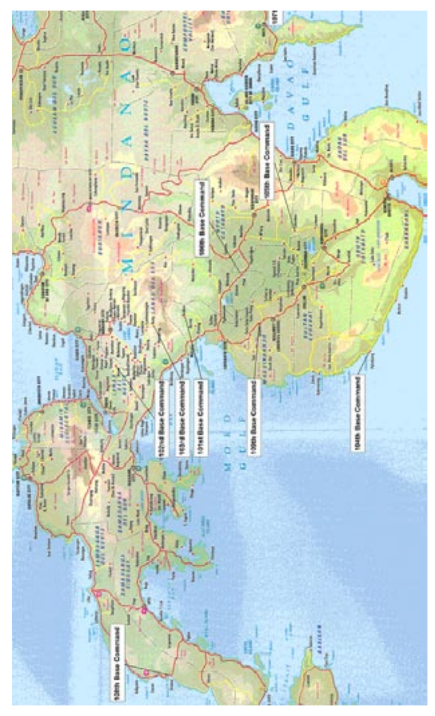
Figure 1. MILF Base Commands.