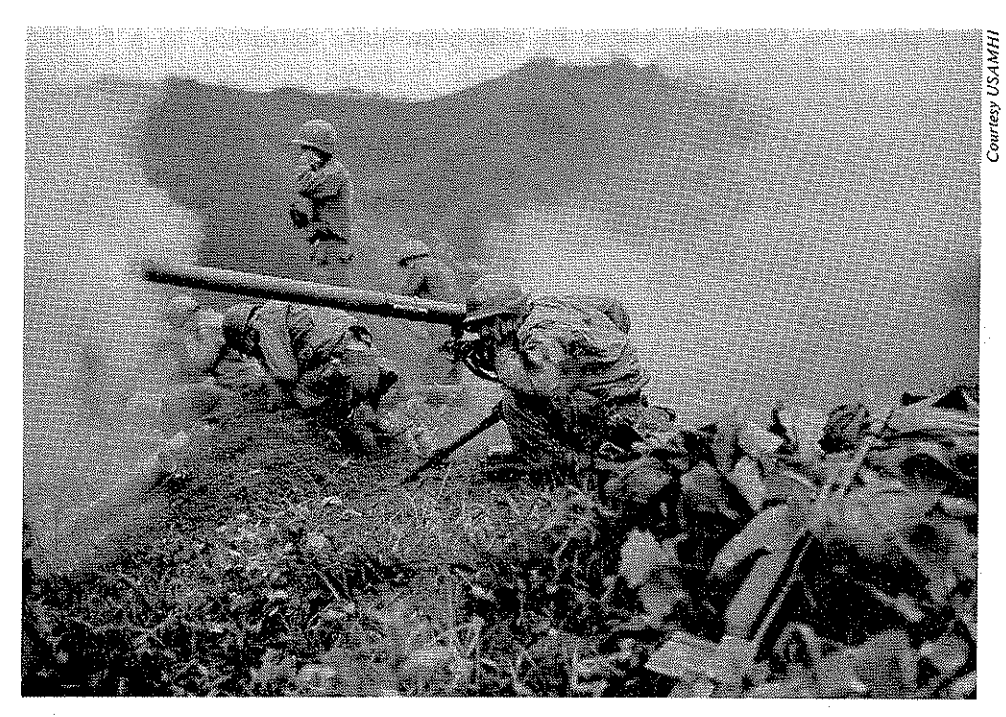
The operational coup at Inchon on 16 September 1950 reversed the tide of the war. Here, US 7th Division forces during the UN advance of 20 May to 24 June 1951.

"A higher commander," Field Marshal Slim wrote, "must think 'big.' "<sup>29</sup> Slim's advice is particularly true at the operational level of war, for at this level the commander must deal, however derivatively, with strategic goals that require him to focus on broad but decisive operational objectives extended over time and space beyond the tactical realm. These objectives can range anywhere from destruction of committed forces or reserves to co-opting allies to even more abstract goals such as eroding the enemy's public support. Neither Dien Bien Phu (1953) nor Tet (1968), for instance, was militarily crippling to the French and American armies, respectively; yet these events struck decisively at the popular and political support of both wars.