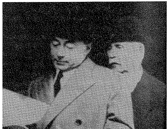
Reynaud and Pétain

Nonetheless, certain political leaders supported De Gaulle's ideas, chief among them being Paul Reynaud, who became the parliamentary champion of the armored corps. Reynaud was convinced France was again preparing for the war that had just been fought, while the Germans were preparing for the war of the future. He earnestly believed