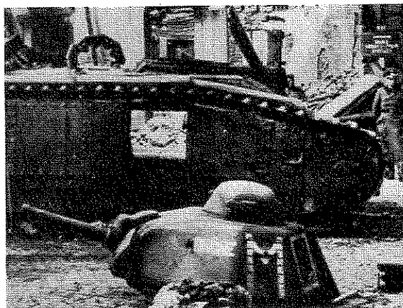
French tank destroyed by the Wehrmacht, 1940.