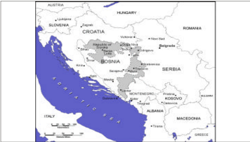
Figure 2. Bosnia, Kosovo, and the Surrounding Region.

Albanians urgently appealed to NATO for assistance, which was provided. Adjacent to Albania is Macedonia, formerly a part of Yugoslavia, but now a free and democratic state. U.S. troops have been on the ground there since 1993 as part of a United Nations (UN) stabilization and security mission, which correctly anticipated the subsequent flow of events. Macedonia, despite the very real centrifugal political forces loosed in the country, managed to hold together during the Kosovo conflict.