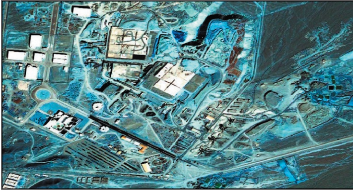
Figure 2. Enrichment Plant Construction.