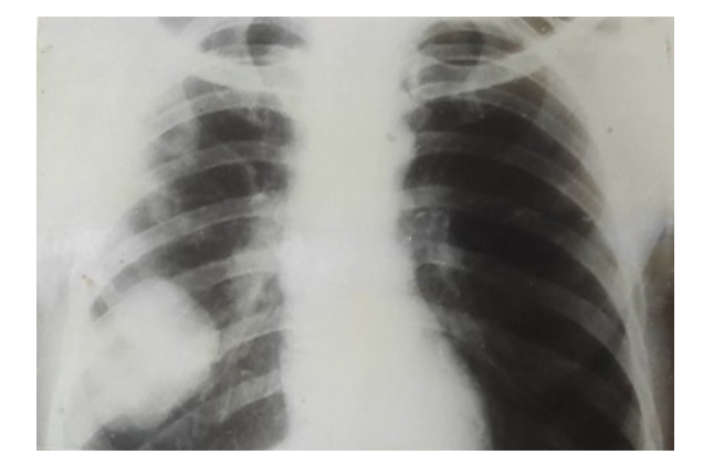
Figure 1:Chest Radiograph showing sharply defined Ovoid mass in the dorsal segment of the right lower lobe.

The maximum age group among the cases were 41-60, and male completely outnumbered the female (35 male and seven female).