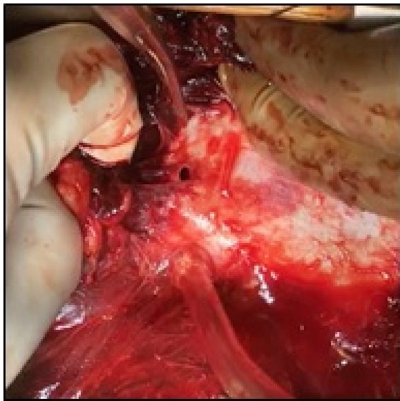
Fig-4: Pericardial injury.

For pericardial injuries, pericardial bleed was controlled with electrocautery and a pericardial window was made both above and below the left phrenic nerve (Figure 4). Right ventricular injuries were repaired with 4-0 prolene and pericardial windows were made both above and below the left phrenic nerve. Right ventricular injuries were repaired without using cardiopulmonary bypass.