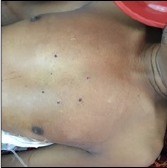
Fig-1: Precordial wounds.