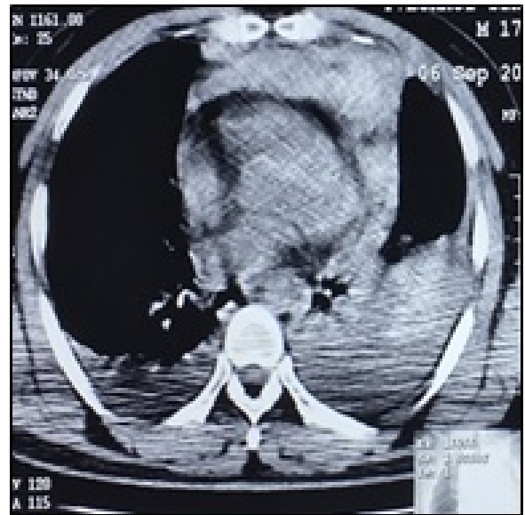
Fig-3: CT scan showing haemopericardium and bilateral haemothorax.

All the patients had haemothorax on the left side except in one patient who had bilateral haemothorax (Figure 3). All the patients had undergone tube thoracostomy in the emergency ward.