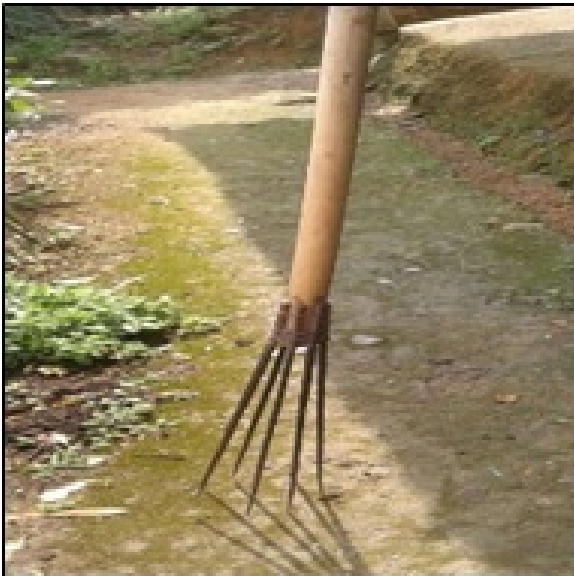
Fig-2: Multipronged spear.

Five (63.3%) patients presented with features of cardiac tamponade or with severe hypotension (systolic BP less than 80 mmHg) and one (16.7%) patient who was haemodynamically stable at the time of presentation had developed features of cardiac tamponade after 24 hours. Clinical presentation at the time of arrival is shown in Table 1.