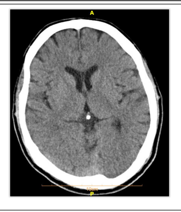
Figure 1: Axial Brain CT scan of the patient.