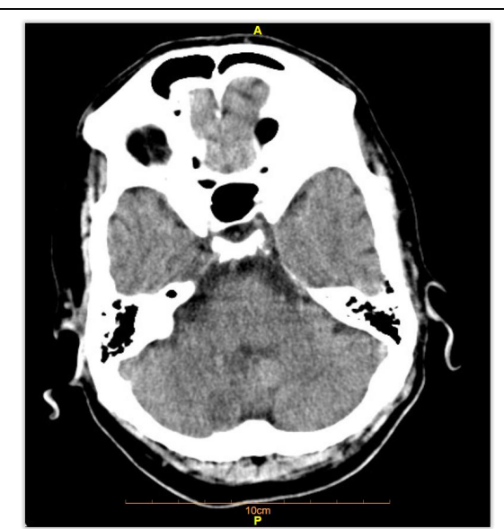
Figure 2: Axial Brain CT scan of the patient Suspicious hypo density focus in posterior inferior aspect of right cerebellar hemisphere