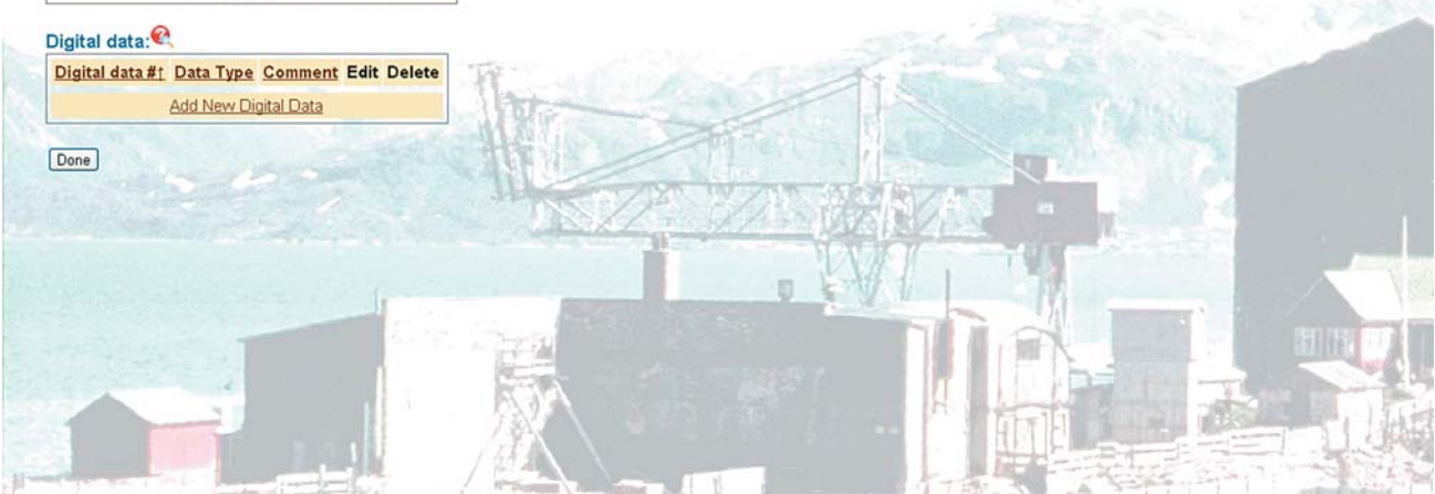
Fig. 3. The DODEX administration is handled in a separate web application, where authorised users, depending on their type can view, update, edit, and delete reports. A screen view of the application for a quality controller to check the status of a report is shown.

tion (Fig. 3), where they can view confidential and un-released reports. Trusted users can only view reports and are not allowed to change the database content.