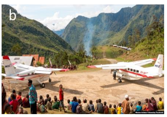
Figure 1. Pioneer Airports in Province of Papua, in (a) Timika and (b) Intan Jaya

Today airports are built conventionally, but Figure 1 are samples of pioneer airport in Province Papua, which are surrounded by mountain and small villages.