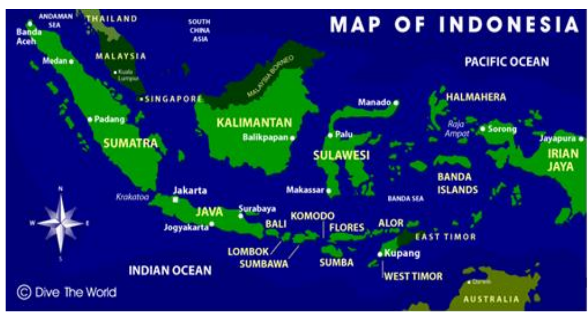
Figure 1. Map of Indonesian Archipelago