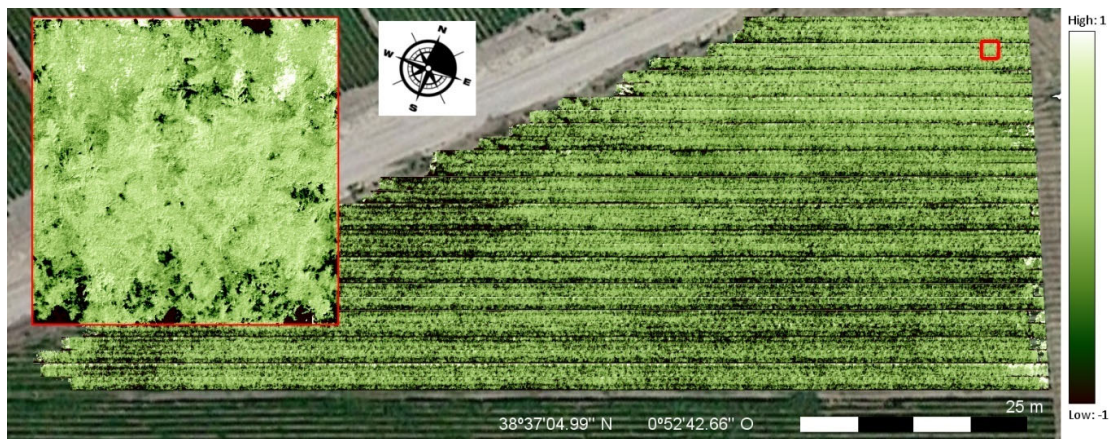
Figure 5. Normalised difference vegetation index (NDVI) map of the carrot field showing a detail of the high spatial resolution.

From the images of the field captured at these wavelengths, it was possible to create maps of vegetation indices. As an example, Figure 5 shows an NDVI map with a detail of the resolution. This NDVI map was created using the 801 and 656 nm images following the equation NDVI = (R_{801} - R_{656}) / (R_{801} + R_{656}) , R_x being the reflectance at wavelength x . However, these indexes resulted ineffective for detection of CaLsol in the 100 reference plants since no differences were found between sound and infected plants.