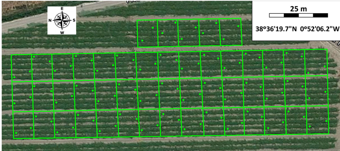
Figure 1. View of the testing field used for validation in the 2018 campaign in Villena, Alicante (Spain). The spots show the distribution of the reference plants.

harvesting (June–November) to observe the evolution of the plants during their growth and to detect the infection as early as possible. Tests were normally done in the morning between 11 a.m. to 2 p.m. During the tests, the robot advanced at a speed of about 1 m/s, capturing images with all cameras every 80 cm (approximately). The images were stored in the SSD (solid-state drive) of the computer and later processed.