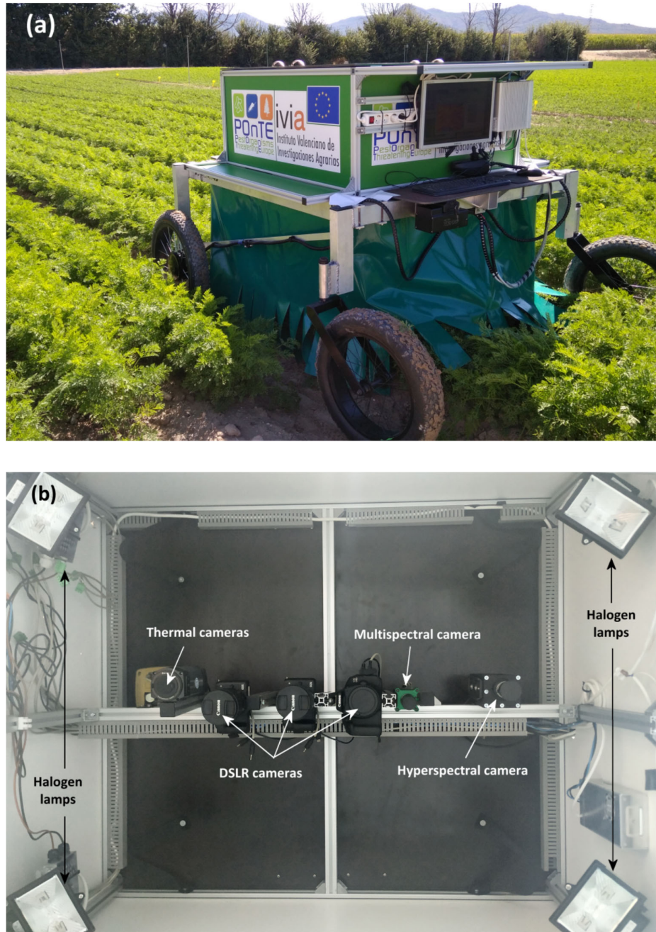
Figure 3. A remotely-driven RobHortic operating in a carrot field. (a) the external appearance of the robot. (b): inside from the plant point of view.

During these tests, the multispectral images were used to calculate vegetation indices, to create maps of the fields. The images captured consecutively were first stitched to form the rows using the stitching software. Later, the rows were joined to complete the map of the field. Images of different wavelengths captured by the multispectral camera were used to obtain the vegetation indices of the field tests. Figure 4 shows a single row of the field captured in the different wavelengths.