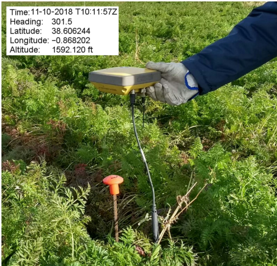
Figure 2. Marking of carrot plants in the test field for further reference and analysis.

Also, to check whether other wavelengths could be useful in the early detection of infection, two spectrometers covering the ranges 200 to 1100 nm (AvaSpec-ULS2048-USB2, Avantes, Inc., Apeldoorn, The Netherlands) and 900 to 1700 nm (AvaSpec-NIR256-1.7, Avantes, Inc., Apeldoorn, The Netherlands) were used. The raw spectra obtained were normalised by dividing each variable by its standard deviation. In this way, the spectral intensities were rescaled to a common range, allowing us to compare the acquired spectra using different equipment with different resolutions.