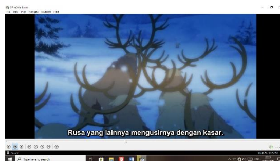
Screenshot 8. Movie video