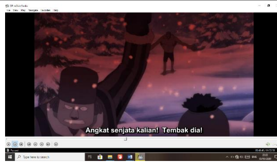
Screenshot 5. Movie video

Chopper in this scene wanted to made a friend with them but they shot him.