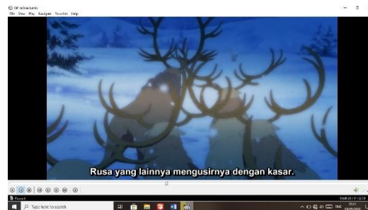
Screenshot 6. Movie video

4). The difference is not a way to intimidate others because all the creature are born by dissimilar.