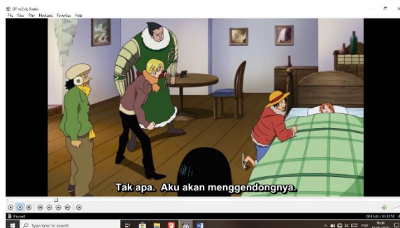
Screenshot 3. Movie Video