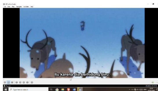
Screenshot 7. Movie video