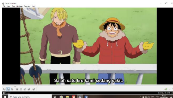
Screenshot 1. Movie video