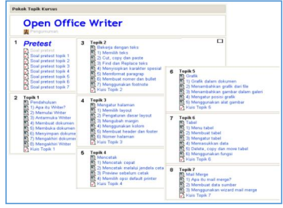
Figure 4. Open office calc learning materials

Open Office Writer is a word processing application that is always needed in making activity proposals, correspondence, scientific articles, etc. The word processing material consists of 7 topics covering introduction, working with text, arranging pages, printing, graphics, tables and mail merges. In addition, it is also completed with pretest and posttest for each topic discussed. A complete view of the material can be seen in Figure 3.