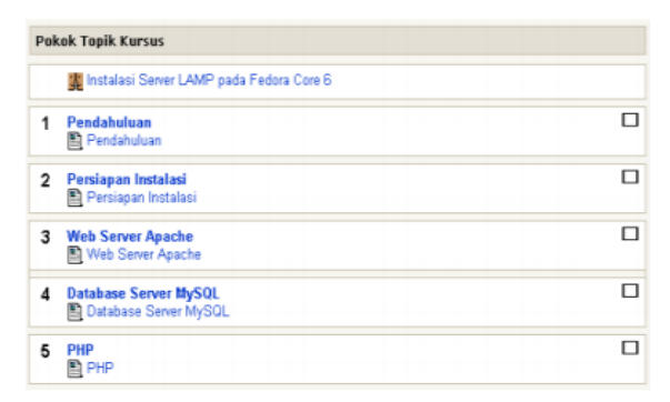
Figure 6. Installing LAMP Fedora core 6

Installing applications on fedora core 6 is an installation process to place an application program on linux fedora core 6. This installation needs to be done because it meets the application demands required by the user. The material provided in this lesson consists of 7 topics covering the installation method; shell commands; create a local repository; program installation; font installation; installation using RPM and installation using source code. A complete view of the material can be seen in Figure 7.