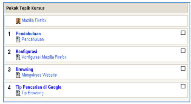
Figure 5. Mozilla firefox learning materials

Mozilla firefox is a browser application that is needed in searching for information on the internet. With a browser looking for information on the internet can be done easily, quickly and efficiently. The mozilla firefox material consists of 4 topics which include an introduction; mozilla firefox configuration; access the website; and google search tips. The appearance of this material can be seen in Figure 5.