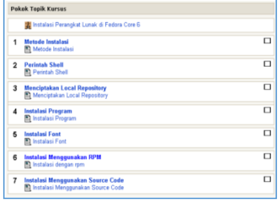
Figure 6. Software installation on fedora core 6

Installing applications on fedora core 6 is an installation process to place an application program on linux fedora core 6. This installation needs to be done because it meets the application demands required by the user. The material provided in this lesson consists of 7 topics covering the installation method; shell commands; create a local repository; program installation; font installation; installation using RPM and installation using source code. A complete view of the material can be seen in Figure 7.